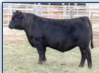
HOOVER MERCURY D86 MERCURY SON SELLS FEBRUARY 3, 2026