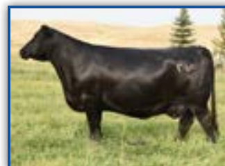
PINE COULEE BLACK ANNIE U7 DAM OF TROPHYCLASS PICTURED AT 8 YEARS OF AGE

She sold in the 2018 Ladies of the Beartooth Sale for $31,000, and has produced over $150,000 in progeny sales including the Lot 1 bull in the 2018 Pine Coulee Bull Sale.