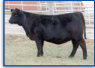
ERICA OF ELLSTON D11 LEGITIMATE DAUGHTER SELLS FEBRUARY 3, 2026