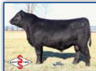
YON SALUDA MATERNAL BROTHER TO STRONG