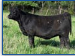
BLUEBLOOD LADY ELLSTON D43 6-MONTH-OLD LEGITIMATE DAUGHTER