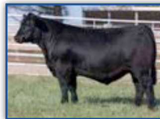
HOOVER GENERAL LEE C414 GENERAL LEE SON SELLS FEBRUARY 3, 2026