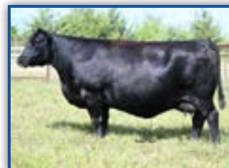
MOHNEN JILT 1848 DAM OF GENERAL LEE