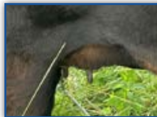
UDDER OF PRIM LASSIE OF ELLSTON A184 TWO-YEAR-OLD EMPIRE DAUGHTER