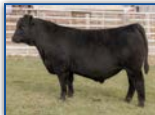
HOOVER LEGITIMATE C26 MATERNAL BROTHER TO DIRECTOR