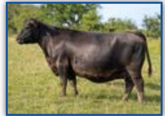
ERICA OF ELLSTON T78 ABOUT IT'S DAM HOOVER ANGUS DONOR