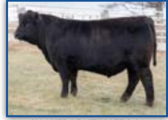
HOOVER LEGITIMATE D41 LEGITIMATE SON SELLS FEBRUARY 3, 2026