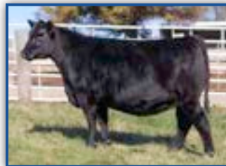
BLUEBLOOD LADY ELLSTON A68 $6250 ATHLETE DAUGHTER