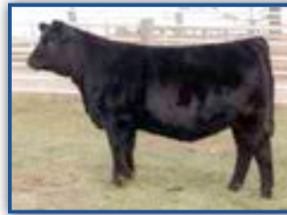
ERICA OF ELLSTON C54 $16,000 LEGITIMATE DAUGHTER