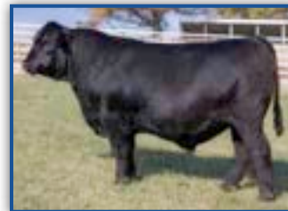
HOOVER ATHLETE C505 ATHLETE SON SELLS FEBRUARY 3, 2026