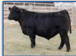
HOOVER TROPHYCLASS D124 TROPHYCLASS SON SELLS FEBRUARY 3, 2026