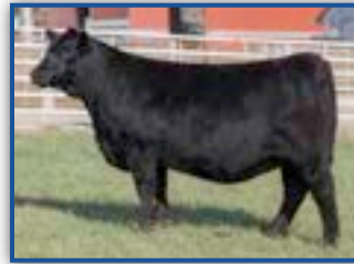
ERICA OF ELLSTON C418 LEGITIMATE DAUGHTER SELLS FEBRUARY 3, 2026