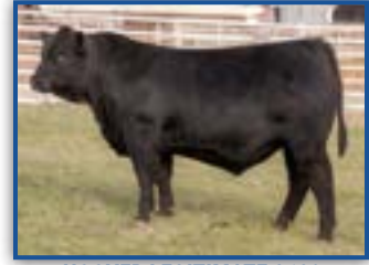
HOOVER LEGITIMATE C139 $18,000 LEGITIMATE SON