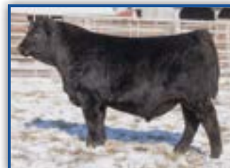
HOOVER TROPHYCLASS B59 $16,500 TROPHYCLASS SON