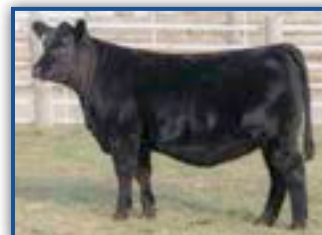
BLACKCAP EMPRESS ELLSTON C73 $9500 GENERAL LEE DAUGHTER