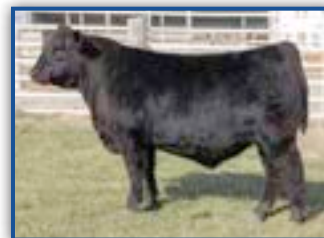
HOOVER TROPHYCLASS C38 $7500 TROPHYCLASS SON