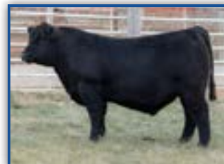
HOOVER GENERAL LEE D15 GENERAL LEE SON SELLS FEBRUARY 3, 2026