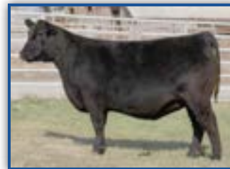
BLKCP EMPRESS ELLSTON B190 $9000 TROPHYCLASS DAUGHTER