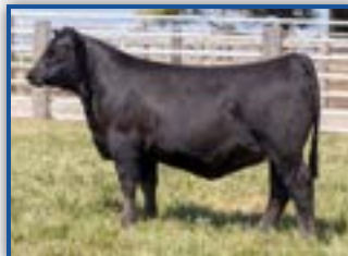
ERICA OF ELLSTON B17

• Optics was one of our largest sire groups in 2022 and 2023, and they have not disappointed yet! These calves were fun to wean, as they showed excellent growth and the added frame and length of body our customers like. If the Angus breed has gotten too small for