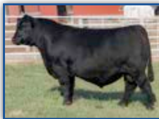
HOOVER GENERAL LEE C456 GENERAL LEE SON SELLS FEBRUARY 3, 2026