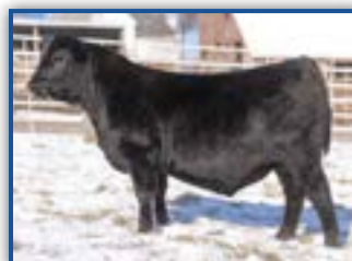
HOOVER TROPHYCLASS B39 $13,000 TROPHYCLASS SON