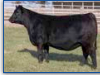
MISS BLACKBIRD ELLSTON C238 LEGITIMATE DAUGHTER SELLS FEBRUARY 3, 2026