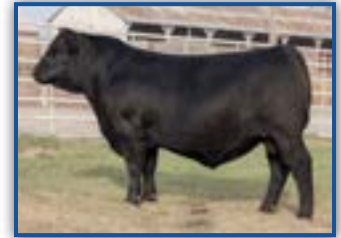
HOOPER EMPIRE B487 $18,000 EMPIRE SON