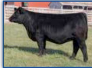
ERICA OF ELLSTON C439 EMPIRE DAUGHTER SELLS FEBRUARY 3, 2026