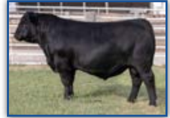
HOOPER AUTHORITY B440 $29,000 EMPIRE SON