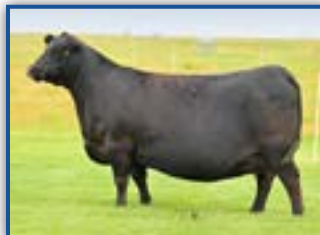
ERICA OF ELLSTON T220