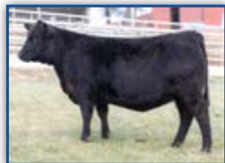
BLKCP EMPRESS ELLSTON D106 MERCURY DAUGHTER SELLS FEBRUARY 3, 2026