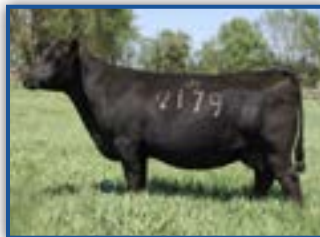
MOGCK RUTH 2179 DAM OF PROMISE