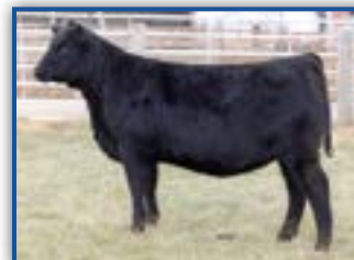
MISS BLACKCAP ELLSTON D67 GALACTIC DAUGHTER SELLS FEBRUARY 3, 2026