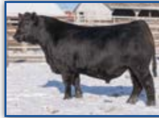
HOOVER CLASSIC B26 $30,000 NO DOUBT SON