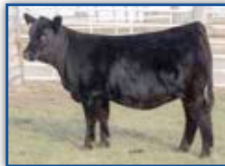
ERICA OF ELLSTON C177 $8000 TROPHYCLASS DAUGHTER