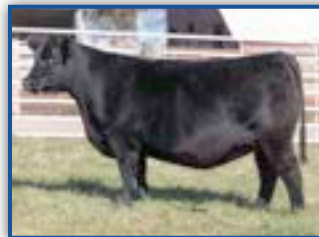
ERICA OF ELLSTON A32 $15,000 ENTICE DAUGHTER