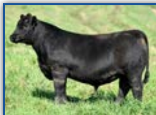
HOOVER GENERAL LEE D32 7-MONTH-OLD GENERAL LEE SON SELLS FEBRUARY 3, 2026