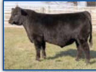
HOOVER LEGITIMATE C49 $8500 LEGITIMATE SON