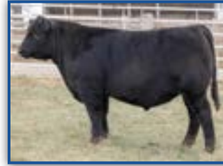
HOOPER EMPIRE D134 EMPIRE SON SELLS FEBRUARY 3, 2026