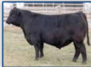
HOOVER GALACTIC D44 GALACTIC SON SELLS FEBRUARY 3, 2026