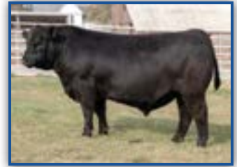
HOOVER NO DOUBT B474 $19,000 NO DOUBT SON