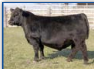
HOOVER TROPHYCLASS C37 $13,000 TROPHYCLASS SON