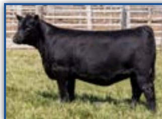
ERICA OF ELLSTON B70 7-MONTH-OLD TROPHYCLASS DAUGHTER