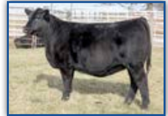
QUEEN OF ELLSTON A88 9-MONTH-OLD EMPIRE DAUGHTER