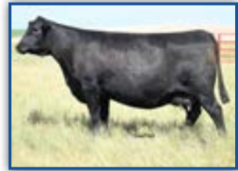
DEEP CREEK RAIN LASS 013 DAM OF LEGITIMATE