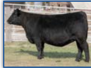
ERICA OF ELLSTON B282 $15,000 EMPIRE DAUGHTER