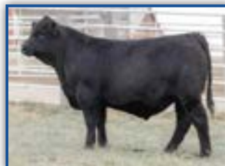
HOOVER GALACTIC D149 GALACTIC SON SELLS FEBRUARY 3, 2026