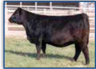
BLACKCAP EMPRESS ELLSTON C60 LEGITIMATE DAUGHTER SELLS FEBRUARY 3, 2026