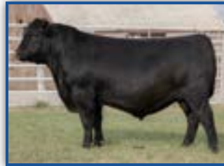
HOOPER EMPIRE B433 $8500 EMPIRE SON