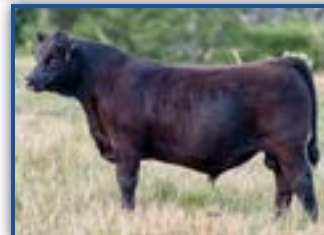
HOOVER OPTICS B2