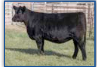
ERICA OF ELLSTON C512 EMPIRE DAUGHTER SELLS FEBRUARY 3, 2026