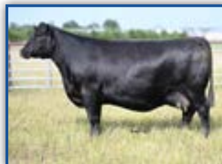
MOHLEN JILT 6900 DAM OF FORCE