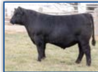
HOOVER GALACTIC D48 GALACTIC SON SELLS FEBRUARY 3, 2026