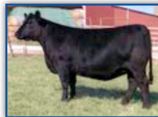
BLACKCAP EMPRESS ELLSTON C70 GENERAL LEE DAUGHTER SELLS FEBRUARY 3, 2026