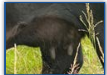
UDDER OF BLKCP EMPRESS ELLSTON A304 TWO-YEAR-OLD EMPIRE DAUGHTER

pounds followed by an 816 pound weaning weight, WR 116, YW 1462 lbs., YR 110.