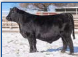
HOOVER MILITIA $27,500 GENERAL LEE SON