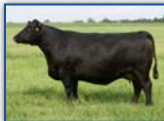
YON SARAH D668 DAM OF YON STRONG