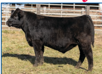
Hoover Alternative A54

All-time ORigen Sales Leader Relative of Lots 2-3