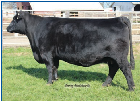
Erica of Ellston M38

Pathfinder Hoover Donor Dam of Lot 2; Grandam (B13) and Great Grandam (B38) of Lot 3