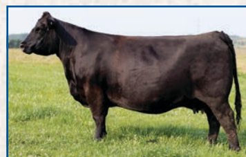
Miss Blackcap Ellston N58 Pathfinder Hoover Donor Flush Sister to No Doubt