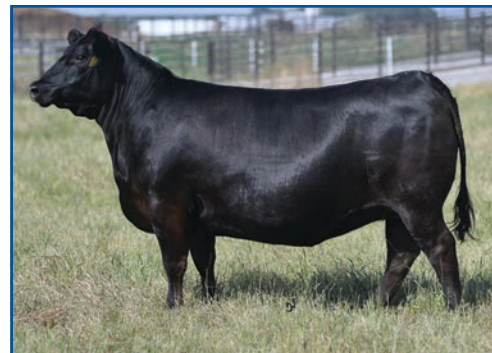
Erica of Ellston T220

Pathfinder Hoover Donor Maternal Sister to Lot 2; Dam (B13) and Grandam (B38) of Lot 3