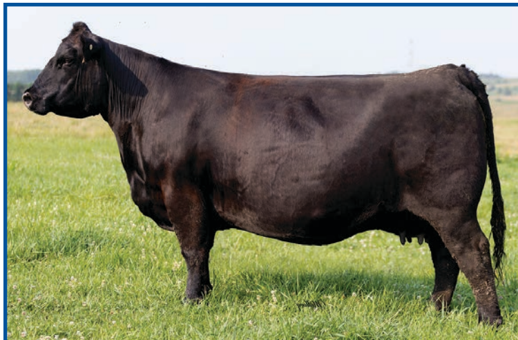
Miss Blackcap Ellston N58 Pathfinder Hoover Donor Dam of Lot 5 Heifers