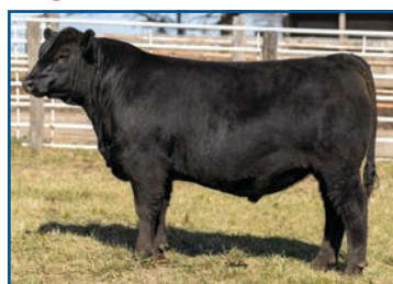
Hoover Creed A7

$23,000 Maternal Brother to Lot 3 (B38) & Relative of Lots 2-3