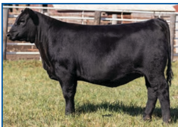
Erica of Ellston A10