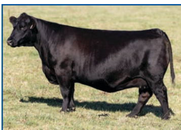
Erica of Ellston T64

Hoover & Baldrige Donor Relative of Lots 2-3