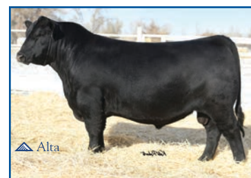
BA7 Oaks Bold Ruler

$20,000 Maternal Brother to Lot 2 Relative of Lot 3