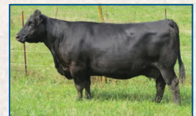
Queen of Ellston C50 Pathfinder Hoover Donor Candid photo at 12 years of age