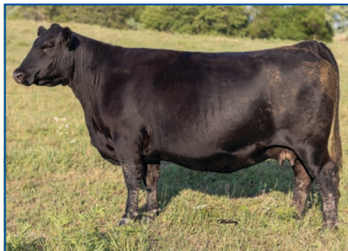
Erica of Ellston R96

Pathfinder Hoover Donor Dam of Lot 2; Grandam (B13) and Great Grandam (B38) of Lot 3