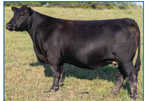
Blkcp Empress Ellston T184 Pathfinder Hoover Donor Dam of Lot 4 Heifers