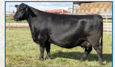
Elbamere Queen Ellston N431 Pathfinder Hoover Donor