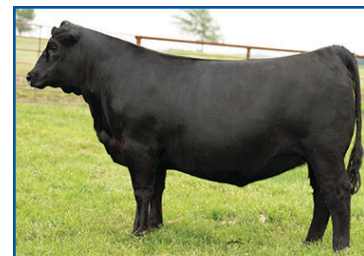
Erica of Ellston Z37