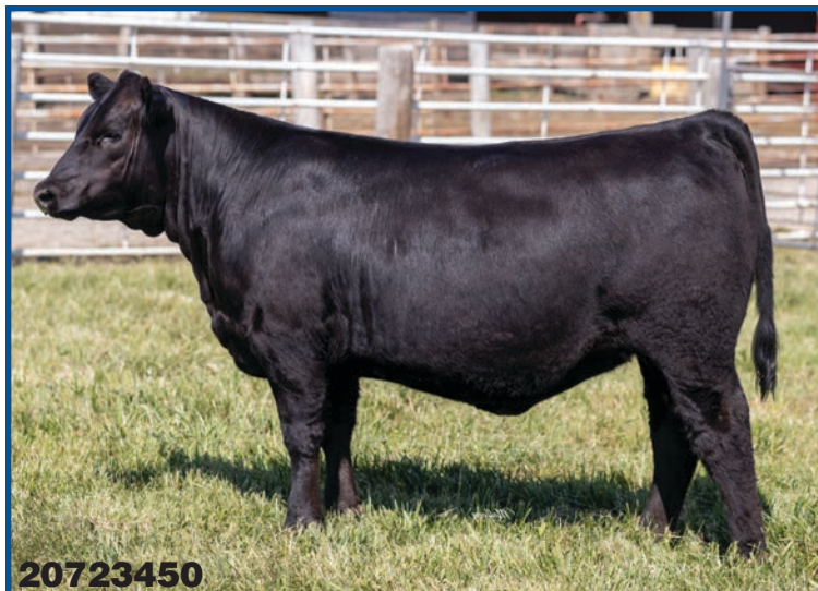
Miss Blackcap Ellston B42