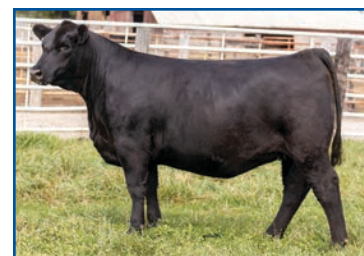
Erica of Ellston X124