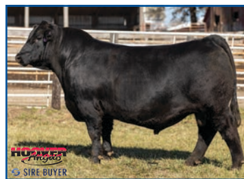
E L K Trophyclass Sire of Lot 2