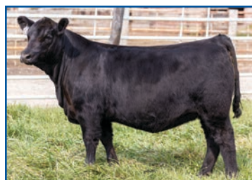
Erica of Ellston Z40