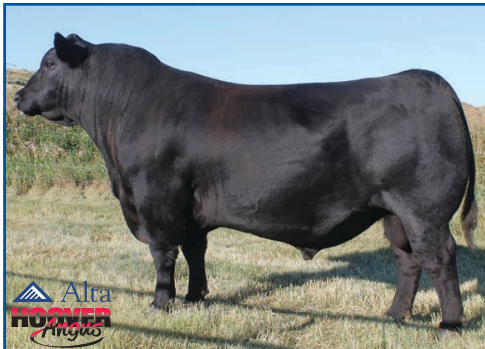
Hoover No Doubt Sire of Erica of Ellston B13