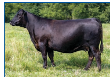
Erica of Ellston S7

Pathfinder Hoover Donor Ancestor of Lots 2-3