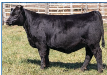
Erica of Ellston A12

Maternal Sister to Lot 3 (B13) Dam of Lot 3 (B38)