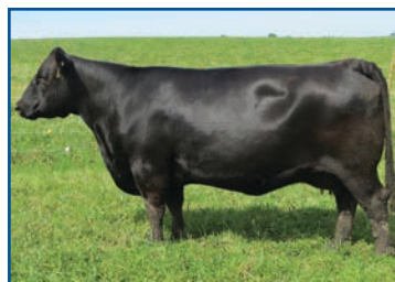
Erica of Ellston G366

Pathfinder Hoover Donor Relative of Lots 2-3