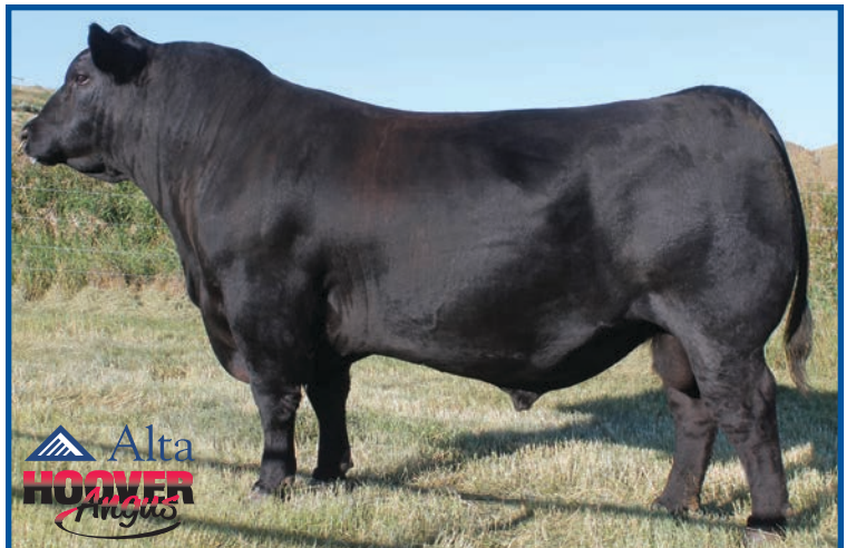
Hoover No Doubt Flush Brother to the Dam of Lot 5