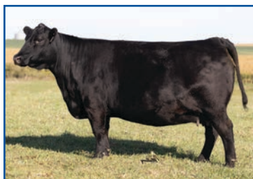
Erica of Ellston R217

Pathfinder Hoover Donor Relative of Lots 2-3