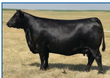
Erica of Ellston L5

Pathfinder Hoover Donor Relative of Lots 2-3