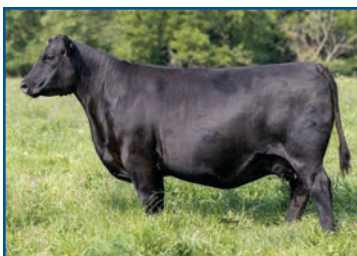
Erica of Ellston N54

Pathfinder Hoover Donor Relative of Lots 2-3