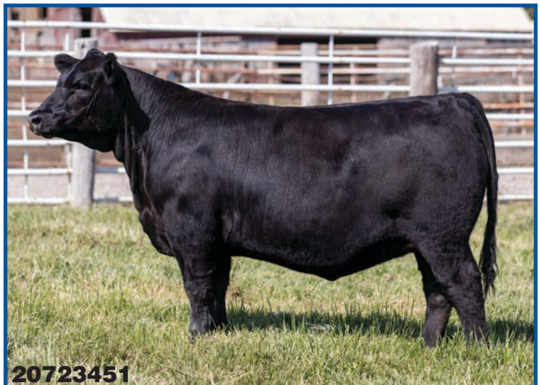
Miss Blackcap Ellston B55