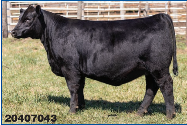
Erica of Ellston A12