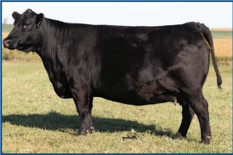
Erica of Ellston R217 Pathfinder Hoover Donor Dam of Lot 4