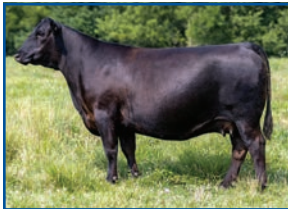
Erica of Ellston S7 Hoover Angus Donor