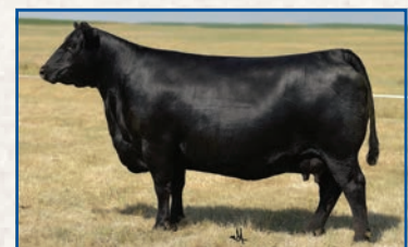
Erica of Ellston L5 Hoover Angus Donor