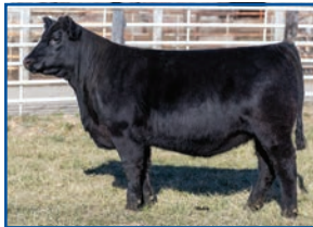
Erica of Ellston X39 $22,000 Female