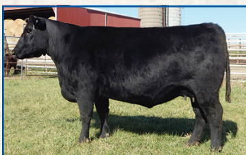
Miss Blackcap Ellston R199 Hoover Angus Donor

Daughters and Descendants of these Maternal Hoover Icons are available in Lot 1