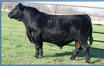
Galaxy Detail 8546 Sire of Lot 3