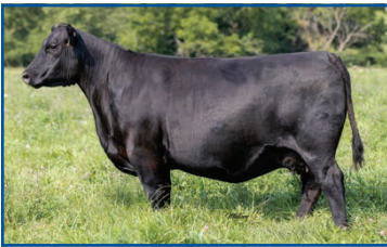
Erica of Ellston N54 Pathfinder Hoover Donor Grandam of Lot 4