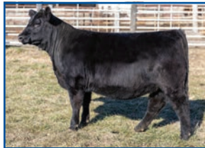
Erica of Ellston X54 $15,000 Female