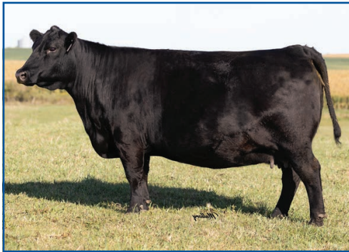
Erica of Ellston R217 Pathfinder Hoover Donor Dam of Five Heifers in Lot 2