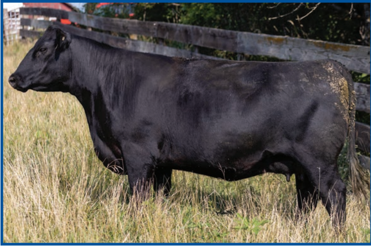
Blackcap Empress Ellston S86 – Dam of Lot 3