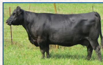
Queen of Ellston C50 Pathfinder Hoover Donor Candid photo at 12 years of age