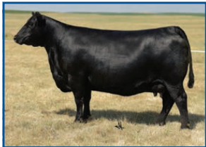
Erica of Ellston L5 Hoover Angus Donor