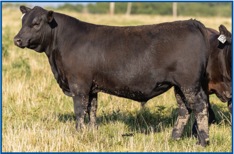
Hoover Homestead A6 – Full Brother to Lot 5