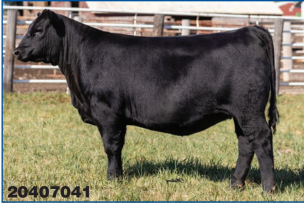
Erica of Ellston A10