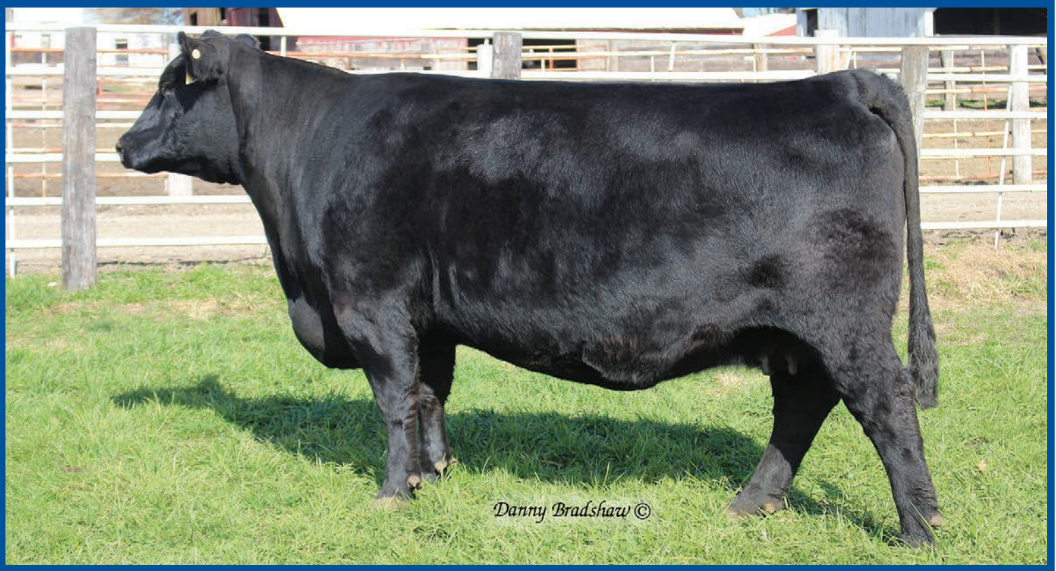
Erica of Ellston M38 – Pathfinder Hoover Donor Dam of Lot 5