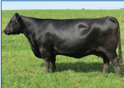
Erica of Ellston G366 Pathfinder Hoover Donor Second, third, or fourth generation dam of Lot 2