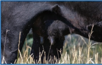
Udder of Blackcap Empress Ellston S86 Dam of Lot 3