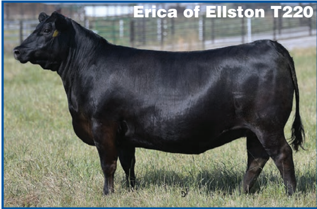
Erica of Ellston T220