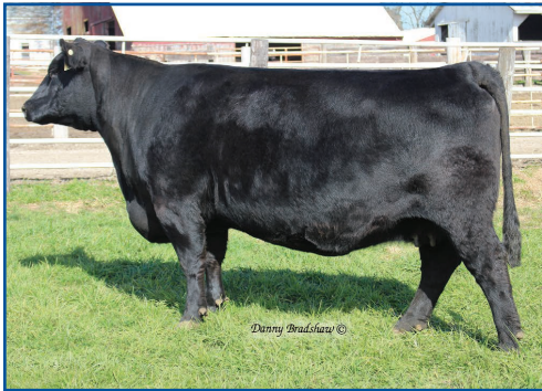
Erica of Ellston M38 Pathfinder Hoover Donor Dam of Four Heifers in Lot 2