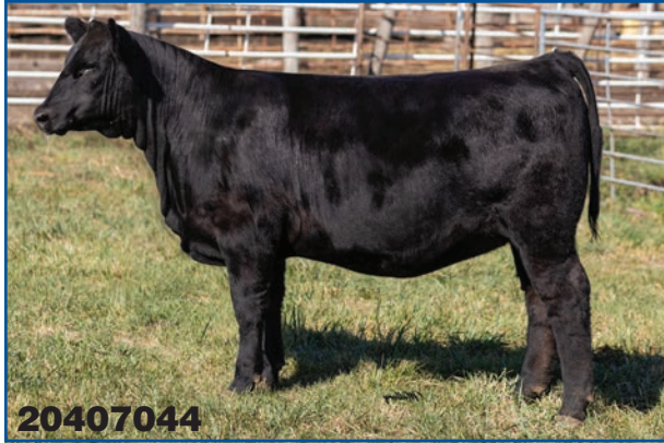
Erica of Ellston A13