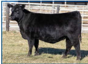
Erica of Ellston X52 $18,000 Female