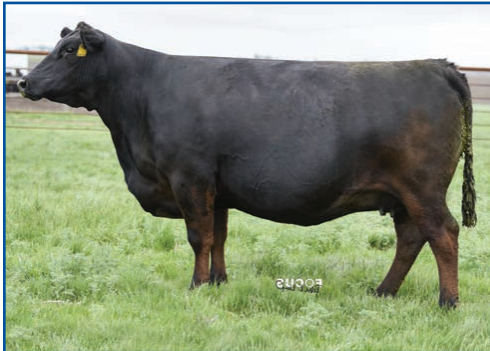
Erica of Ellston R65 Dam of One Heifer in Lot 2