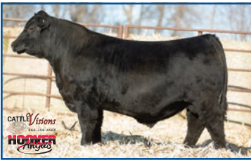
Raml Optics 0710 Sire of Lot 4