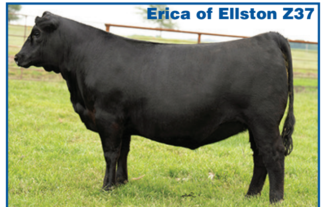
Erica of Ellston Z37

Moon Creek Farms and Hansine Ranch Partnership purchased the "Pick of the Ericas" in our online sale last October. Nine months later, the top-selling embryos in their sale were out of this female! Z37 has become a preeminent donor in Moon Creek's superior donor line-up, and we'll see more from her in the future.