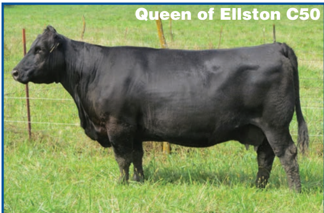
Queen of Ellston C50