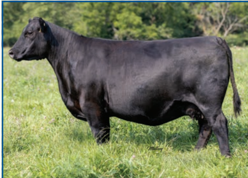
Erica of Ellston N54 Pathfinder Hoover Donor Grandam of Five Heifers in Lot 2