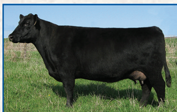
Blackcap Empress Ellston C344 Pathfinder Hoover Donor Photo at 8 years of age