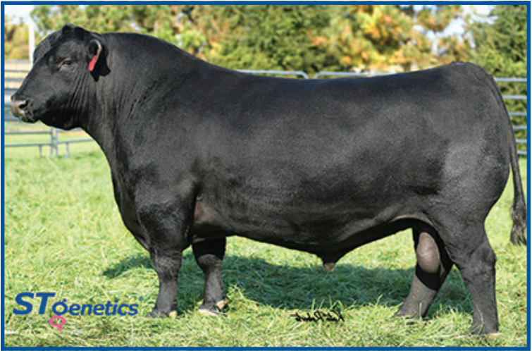
Ellingson Homestead 6030 – Sire of Lot 5