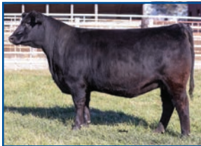
Erica of Ellston V88 $32,000 Female