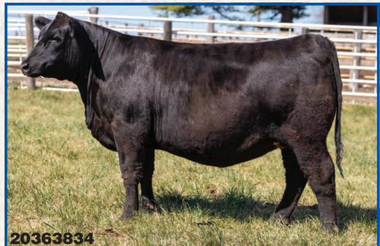
Miss Blackcap Ellston Z400 – Available in the Lot 1 Pick