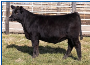
Erica of Ellston Z39 $20,000 Female