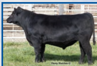
Hoover Entice V43 Entice Son Sells February 4, 2020