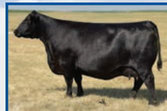
Baldridge Isabel Y69 Dam of 38 Special

a safe choice for use on heifers. His daughters now in production are beautifully uddered females that raised some exceptional calves their first year. A 38 Special daughter raised the #1 adjusted weaning weight heifer calf of our spring 2019 crop!