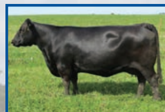
Erica of Ellston G366 Dam of N29 Grandam of Top Notch and Cut Above