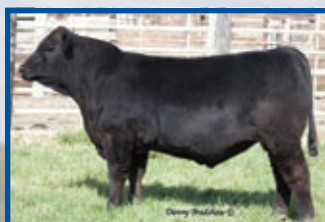
Hoover Entice V125 Entice Son Sells February 4, 2020