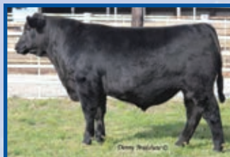
Hoover 38 Special S25 $12,000 38 Special Son