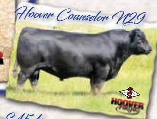
Hoover Counselor N29