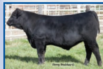
Hoover Entice V40 Entice Son Sells February 4, 2020