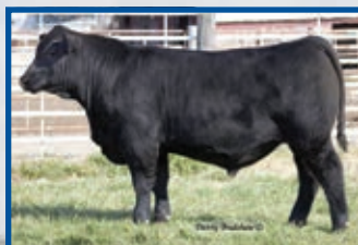
Hoover Delmonico V116 Delmonico Son Sells February 4, 2020

[AMF, CAF, D2F, DDF, M1F, NHF, OHF, OSF, RDF]