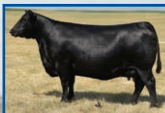
Erica of Ellston L5 Full Sister to N29 Dam of Top Notch and Cut Above