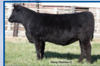
Pride of Ellston V62 38 Special Daughter Sells February 4, 2020