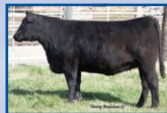
Queen of Ellston T171 Cut Above Daughter Sells February 4, 2020