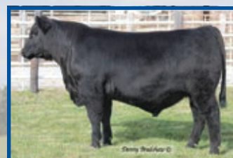
Hoover Top Cut S1 $10,000 Top Cut Son