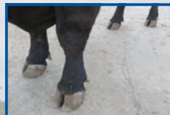
Delmonico's feet as a coming three year-old