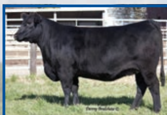
Miss Erica Ellston T187 Top Cut Daughter Sells February 4, 2020

[AMF, CAF, D2F, DDF, M1F, NHF, OHF, OSF, RDF]