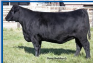
Lady Ida of Ellston T86 38 Special Daughter Sells February 4, 2020