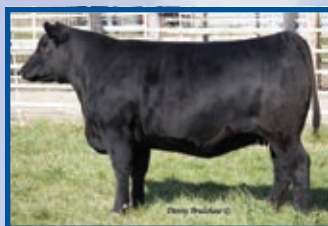
Blackbird of Ellston T162 Cut Above Daughter Sells February 4, 2020