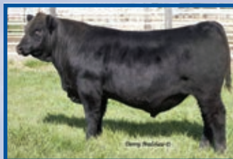
Hoover Chairman V67 Chairman Son Sells February 4, 2020