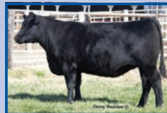
Miss Blackcap Ellston T269 Chairman Daughter Sells February 4, 2020