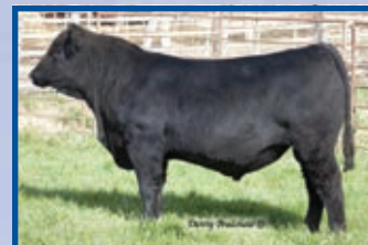
Hoover Entice V63 Entice Son Sells February 4, 2020