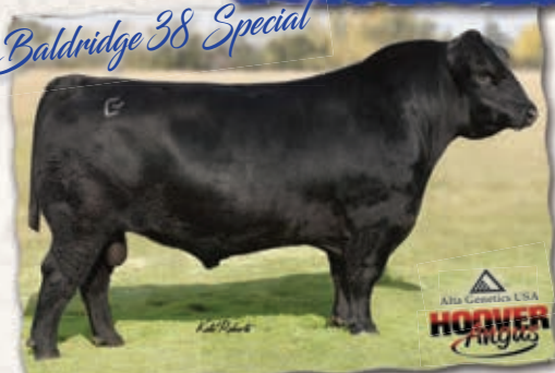
Balldridge 38 Special