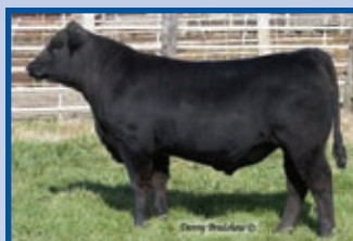
Hoover Entice V22 Entice Son Sells February 4, 2020