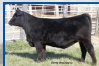
Blackcap Empress Ellston V27 Entice Daughter Sells February 4, 2020