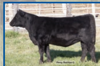
Blackcap Mary of Ellston V136 Entice Daughter Sells February 4, 2020

For more photos and detailed information on Hoover herd sires, visit www.hooverangus.com/herdsires.html