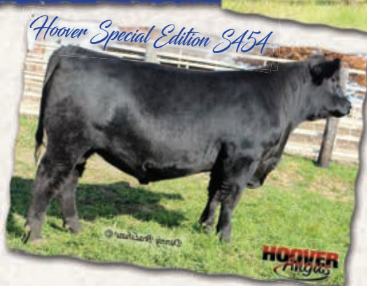
Hoover Special Edition 3454