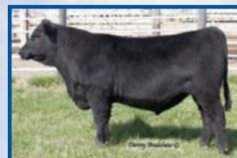
Hoover Entice V74 Entice Son Sells February 4, 2020