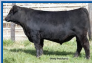
Hoover Entice V24 Entice Son Sells February 4, 2020