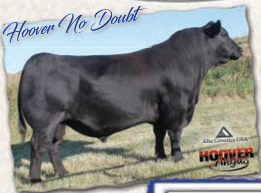
Hoover No Doubt