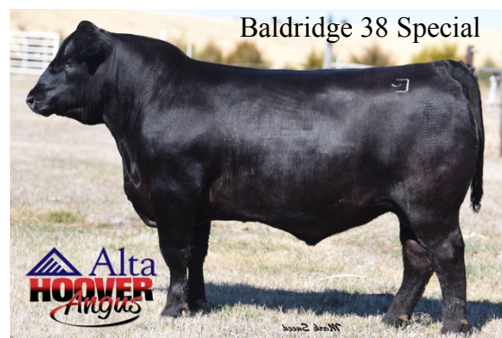
Baldrige 38 Special