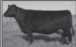
Blkcp Empress Ellston C344

Pathfinder Hoover Donor Pictured at 8 years of age Dam of Lot 47, Grandam of Lot 48 & 49, Relative of Lots 50-53