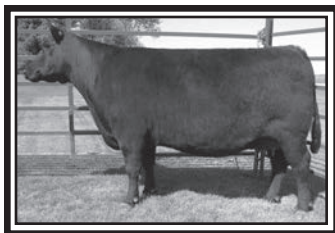
Lady Ida of Ellston C164 Pathfinder Hoover Donor Dam of Lots 156 & 157, Grandam of Lot 155