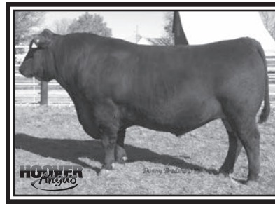
Connealy Reward Hoover Herd Sire Maternal Grandsire of Lot 175