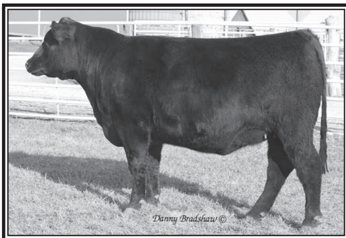
BLUEBLOOD LADY ELLSTON R257 – Lot 130