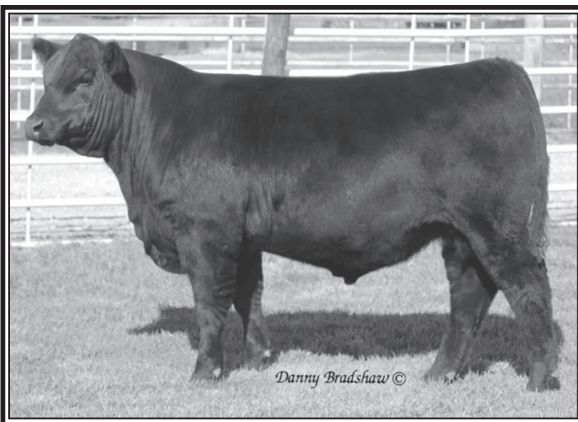
HOOVER NO DOUBT S259 – Lot 1