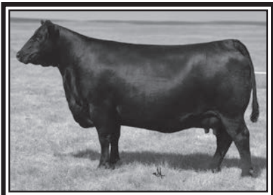
Erica of Ellston L5 Owned by Baldrige Bros. Full Sister to the Dam of Lots 1 and 6 Maternal Sister to Lots 2-4