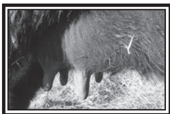
Udder of Blackcap Empress Ellston G30 Dam of Lot 51, Relative of Lots 47-53