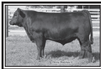
Hoover Top Cut R40 Owned by Wayne & Brian Reinhart $9500 Full Brother to Lot 4