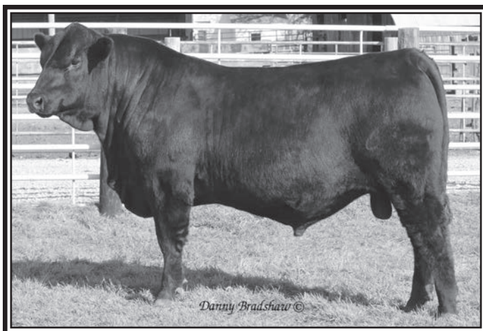
Danny Bradshaw ©