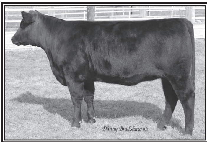
BLKCP EMPRESS ELLSTON R413 – Lot 164