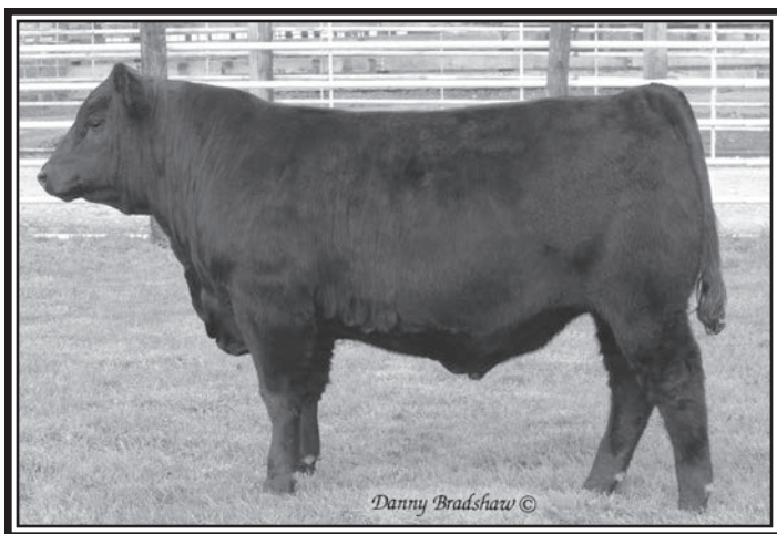
HOOVER 38 SPECIAL S64 – Lot 5