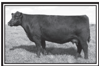
Princess of Ellston G25 Pathfinder Hoover Donor Dam of Lot 34