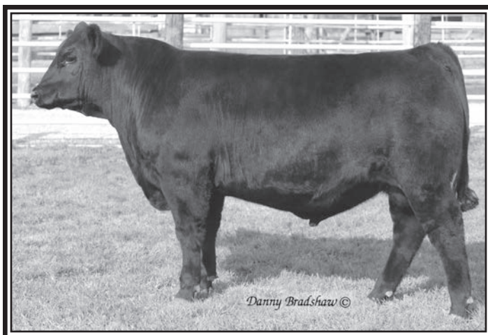
Danny Bradshaw ©