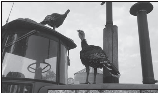
Thanksgiving dinner on top of the tractor!