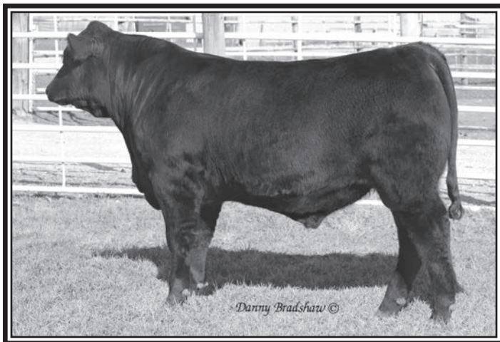
HOOVER SIZZLE S28 – Lot 44