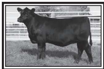
Blackcap Empress Ellston N24 Maternal Sister to Lot 47, Relative of Lots 48-53