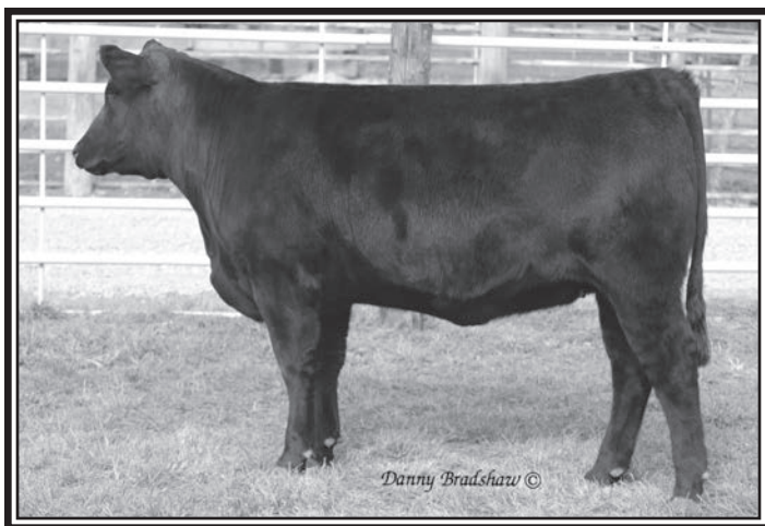
ERICA OF ELLSTON R412 – Lot 161