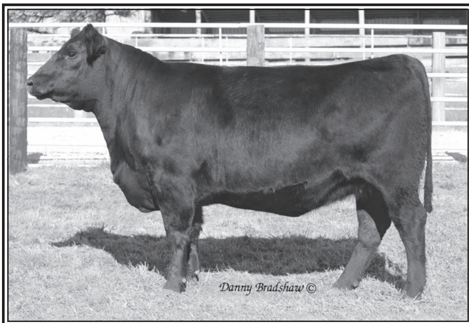
ERICA OF ELLSTON R96 – Lot 109