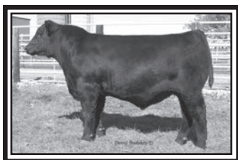
Hoover Herdmaker Full Brother to the Dam of Lot 5 Relative to Lots 1-8