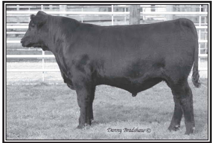
HOOVER SIZZLE S39 – Lot 39