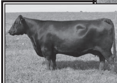
Hoover Counselor N29 Owned with Select Sires and Borns Angus $39,000 Full Brother to the Dam of Lot 110 and Maternal Brother to the Dam of Lot 109