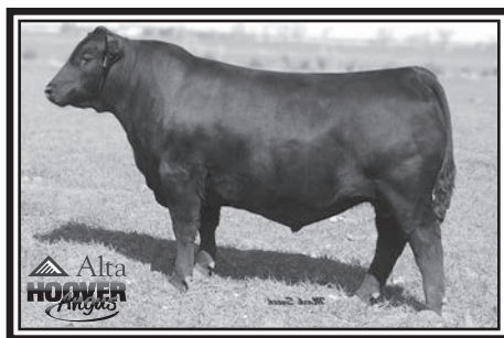
Hoover Inspiration Owned with Alta Genetics $56,000 Full Brother to the Dam of Lot 155, Maternal Brother to Lots 156 & 157