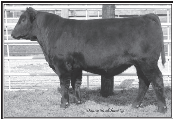
HOOVER CHIEF S76 – Lot 48