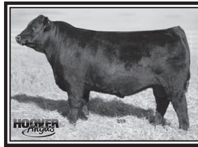
Hoover Headliner J32 Hoover Herd Sire Sire of Lot 176 & 178

In case this catalog doesn't have enough information for you, visit www.hooverangus.com , one of the most informative breeder sites in the country! Herd Sire web pages on 32 bulls share more progeny photos and information than is contained in this catalog.