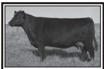
Blkcp Empress Ellston C344 Pathfinder Hoover Donor Pictured at 8 years of age Grandam of Lot 158