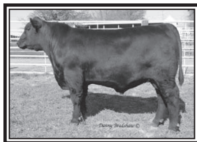
Bakers Choice Owned with Loren Parkhurst Sire of Lots 165 & 166