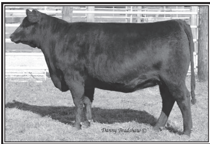
ERICA OF ELLSTON R65 – Lot 110