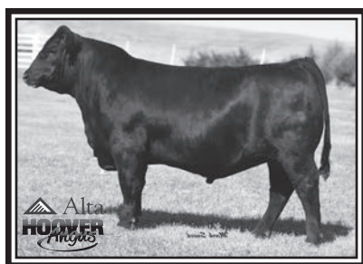
Hoover Quintain Owned with Alta Genetics and Diamond J Angus $26,000 Full Brother to Lot 8