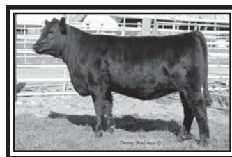
Erica of Ellston N2 Dam of Lot 6 Full Sister to the Dam of Lot 1, Relative to Lots 2-8