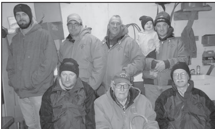
Hoover crew decked out in new J&R Feed/Hoover Angus apparel!