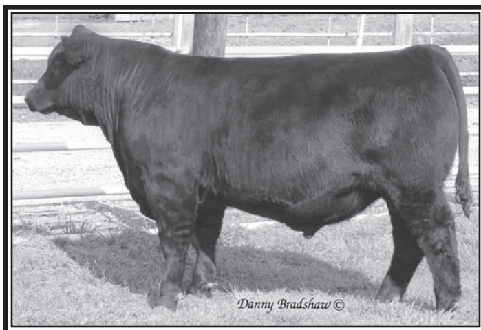
HOOVER PRINCE – Lot 4