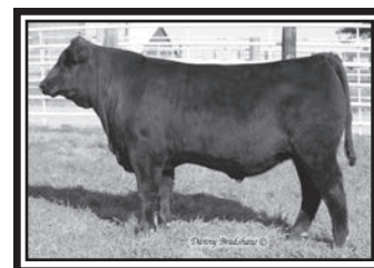
Hoover Impact R171 Owned by Dale Miller $9000 Maternal Brother to Lot 33