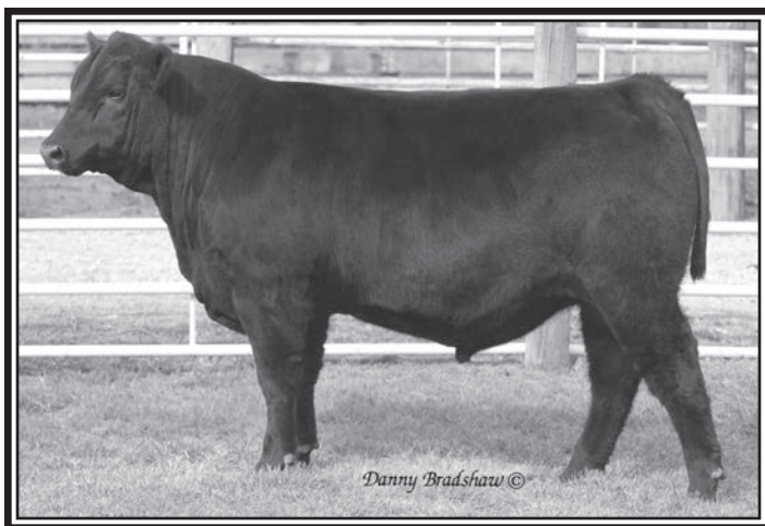
HOOVER ELATION S46 – Lot 14