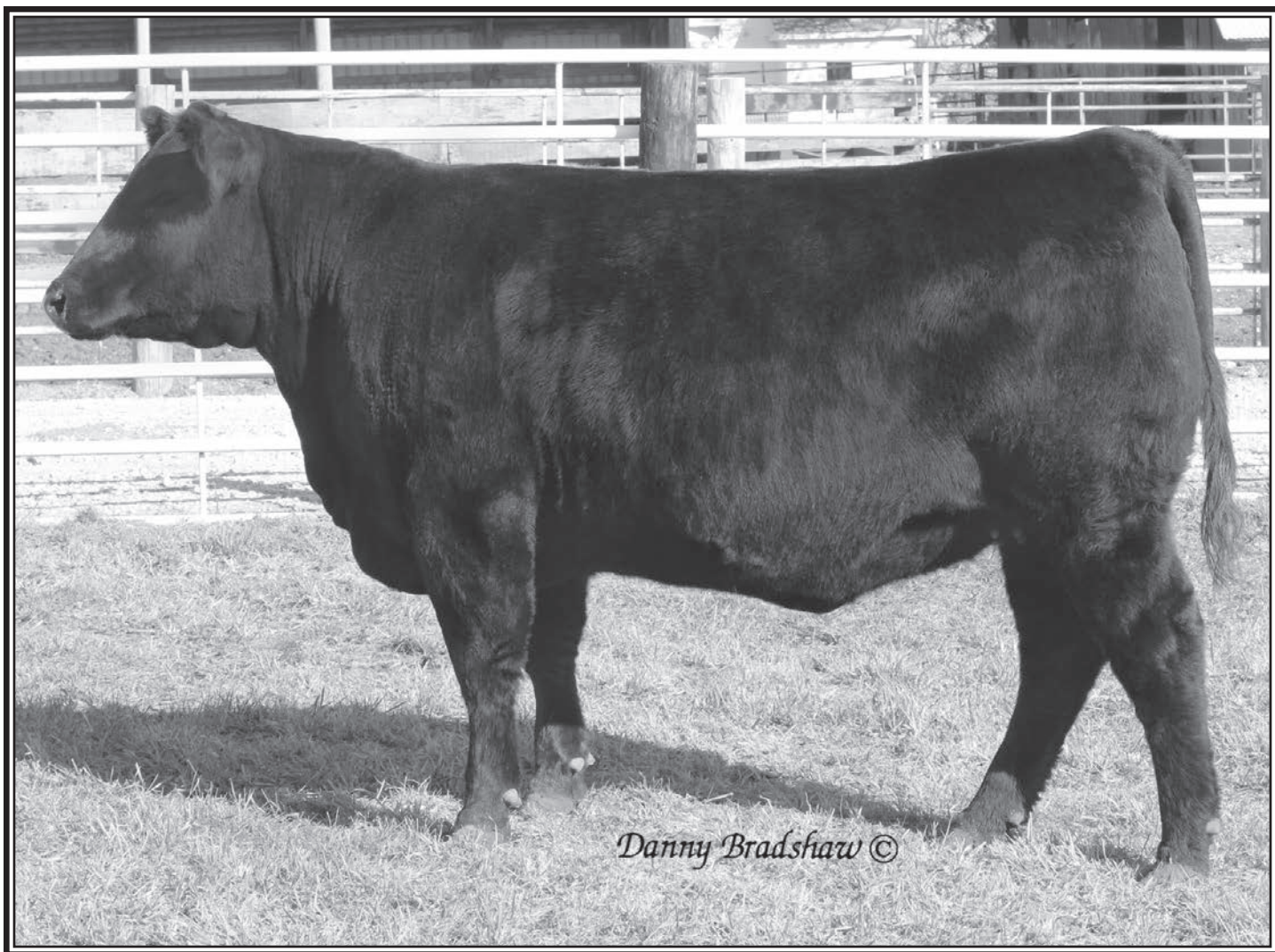
MAID OF ELLSTON R334 – Lot 120