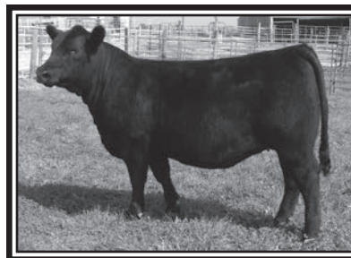
Blackbird of Ellston N40 Dam of Lot 152