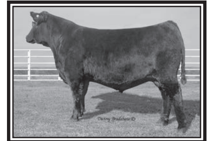
Hoover G Force Owned by Hawleys Gen X Angus Full Brother to Lots 25-27