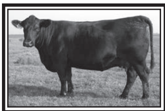
Miss Blackcap Ellston C446 candid photo of Pathfinder Dam of Lot 44