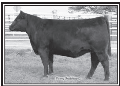
Blackbird of Ellston P96 Owned by Tim Hackett $4500 Full Sister to Lot 115