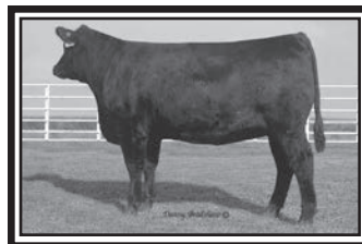
Miss Blackcap Ellston G417 Hoover Angus Donor Grandam of Lot 93