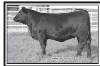
Miss Blackcap Ellston P408 Owned by Sydenstricker Genetics $7000 Maternal Sister to Lot 93