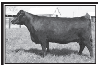
Blackcap Empress Ellston L4 Dam of Lot 158