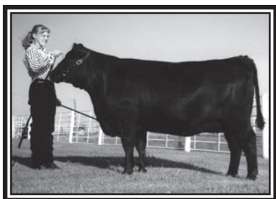
Blackcap Empress Z9 Great Grandam of Lot 117