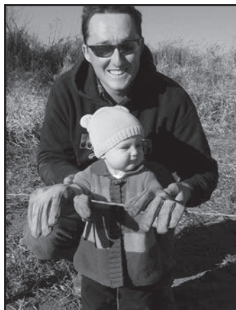
Learning from Daddy about making good fence!