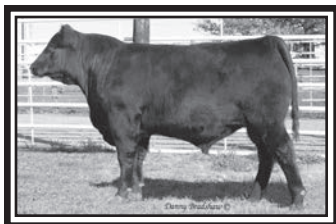
Hoover Top Cut P27 Owned by Carrier Farms $8500 Maternal Brother to Lot 48 Relative of Lots 47-53