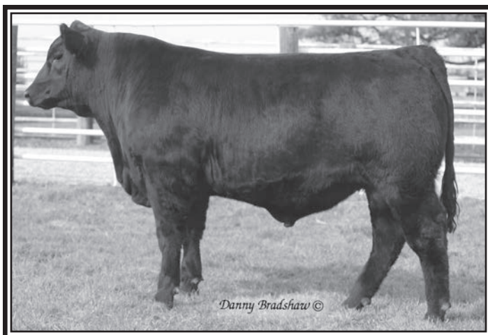
HOOVER COMMANDER S23 – Lot 2