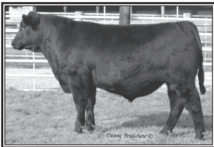
HOOVER 38 SPECIAL S25 – Lot 34