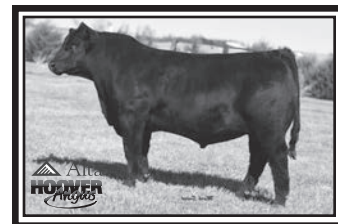
Hoover Ambition Owned with Alta Genetics $30,000 Relative to Lots 1-8