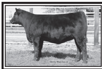
Erica of Ellston N31 Owned by KDS Angus $12,000 Full Sister to the Dam of Lots 1 and 6