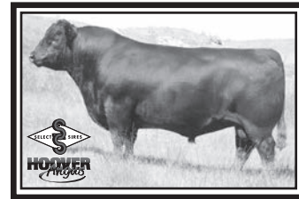
Hoover Counselor N29 Owned with Select Sires and Borns Angus $39,000 Full Brother to the Dam of Lots 1 and 6 Maternal Brother to Lots 2-4