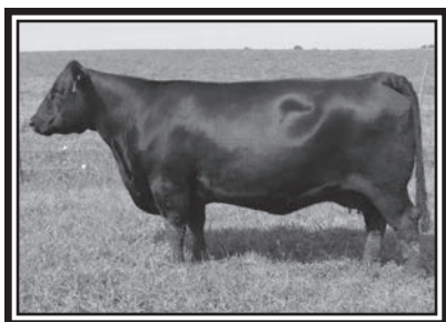
Erica of Ellston G366 Pathfinder Hoover Donor Candid photo at 8 years of age Dam of Lots 2-4 Grandam of Lots 1, 5, 6