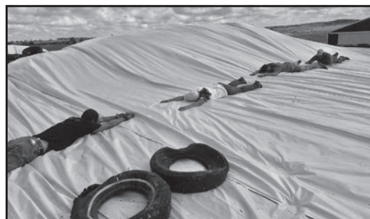
Tarpping the silage pit 2017... It was a bit of a challenge with the wind blowing the tarp up faster