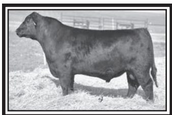
Hoover Homestead Owned by Brice Conover and Prairie View Farms $8250 Maternal Brother to the Dam of Lot 108