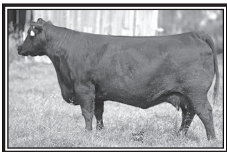
Lady Ida of Ellston G180 Owned by Gary Wall and Carter Angus $9000 Relative to Lots 154-157