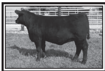
Miss Erica Ellston N250 Maternal Sister to Lot 137