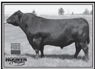
Connealy Counselor Hoover Angus Herd Sire Sire of Lot 123