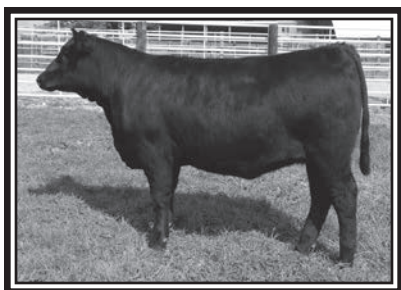
Miss Erica Ellston N21 Dam of Lot 121