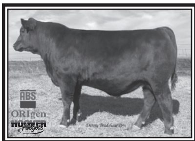
Hoover Hawkeye Owned with Three Trees Ranch, Basin Angus Ranch, and ABS $43,000 Maternal Brother to Lot 32