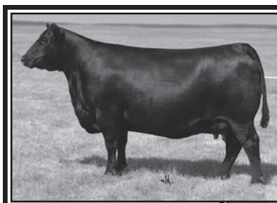
Erica of Ellston L5 Owned by Baldridge Bros. Dam of Lot 110 Maternal Sister to the Dam of Lot 109