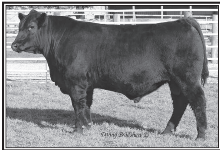
HOOVER DAM R440 – Lot 93