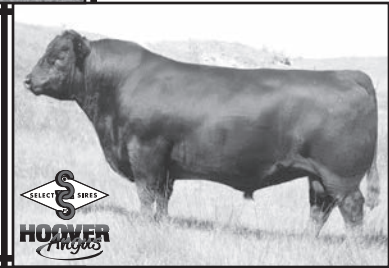
Hoover Top Notch P409 Owned with Select Sires, Baldridge Bros., and Ray Sikes $33,000 Full Brother to Lot 110