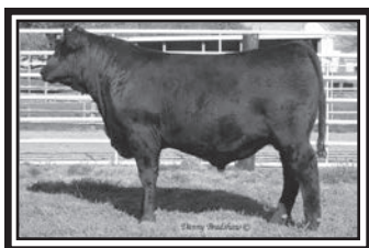
Hoover Impact P26 Owned by Mike Archer $6750 Full Brother to Lot 67