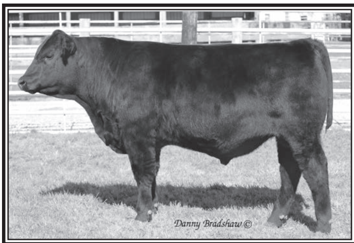
HOOVER 38 SPECIAL S71 – Lot 54