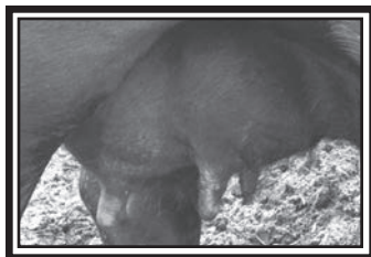
Udder of Lady Ida of Ellston C164 24 hours after weaning her 10th calf. Dam of Lots 156 & 157, Grandam of Lot 155