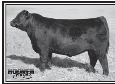
Hoover Headliner J32 Hoover Herd Sire Full Brother to Lots 25-27

At 15 ½ years of age, we buried Gridiron north of our bull barn this past summer. Gridiron earned Pathfinder honors his first year of eligibility, and his daughters produced top-selling bulls in our sales for many years. We appreciate the Gridiron daughters for their longevity, and Gridiron has left a profound impact on our herd. Progeny were noted for added thickness, muscle, growth, and ribeye size.