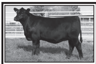
Blackcap Empress Ellston N24 Dam of Lot 143