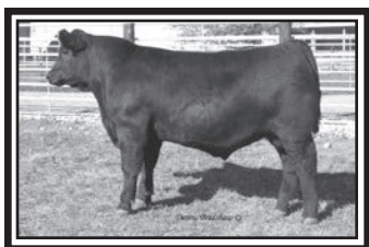
Hoover Headliner M36 Owned by Moore Land & Livestock $8750 Maternal Brother to Lot 137