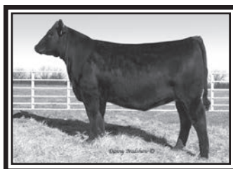
Miss Blackcap Ellston J2 Owned by KDS Angus $20,000 Grandam of Lot 33