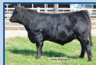
Hoover Excitement R1 Excitement Son Sells February 7, 2017