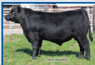
Hoover Bullseye R42 Bullseye Son Sells February 7, 2017