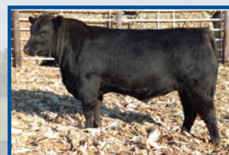
Hoover Elation P79 $5000 Elation Son