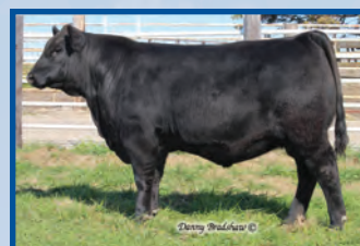
Hoover Hawkeye R10 Hawkeye Son Sells February 7, 2017