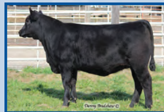
Blkcp Empress Ellston R149 Impact Daughter Sells February 7, 2017