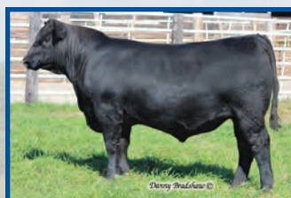
Hoover Elation R55 Elation Son Sells February 7, 2017