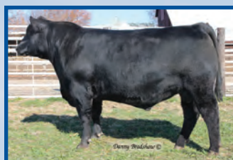
Hoover Excitement N427 $21,000 Excitement Son

[AMF, CAF, D2F, DDF, M1F, NHF, OHF, OSF]