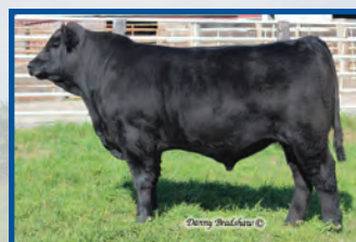
Hoover Gold Mine R44 Gold Mine Son Sells February 7, 2017