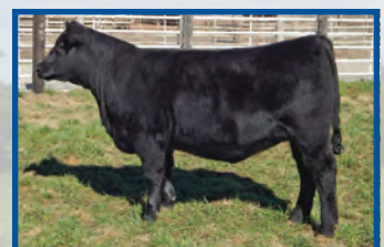
Elbamere Queen Ellston R104 Gold Mine Daughter Sells February 7, 2017