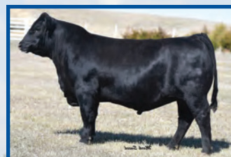
Hoover Quintain $30,000 Bullseye Son