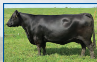
Erica of Ellston G366 Pathfinder CC&7 Daughter