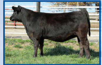
Miss Blackcap Ellston L23 Counselor Daughter