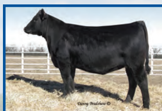
Miss Blackcap Ellston J2 Dam of Hoover No Doubt