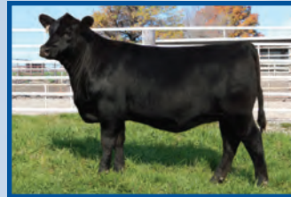
Blackcap Empress Ellston N24 Counselor Daughter