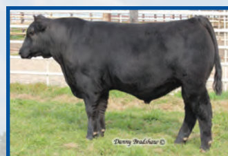
Hoover No Doubt R67 No Doubt Son Sells February 7, 2017