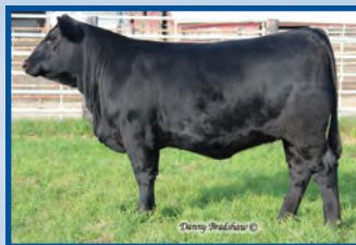
Miss Blackcap Ellston P408 Impact Daughter Sells February 7, 2017