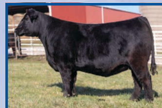
Erica of Ellston A96 Entice Daughter Sells February 6, 2024