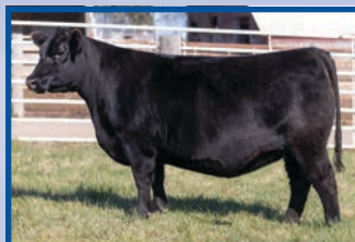
Erica of Ellston A32 Entice Daughter Sells February 6, 2024