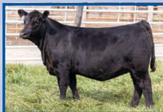
Erica of Ellston Z40 $30,000 No Doubt Daughter