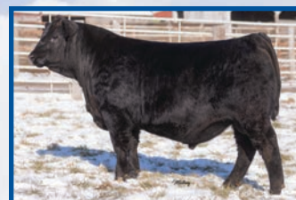
Hoover Trophyclass B59 Trophyclass Son Sells February 6, 2024