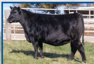
Blueblood Lady Ellston A68 Athlete Daughter Sells February 6, 2024

[AMF, CAF, D2F, DDF, M1F, NHF, OHF, OSF, RDF]