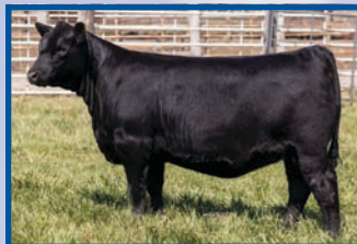
Erica of Ellston B70 7 month-old Trophyclass Daughter