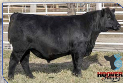
Hoover About It