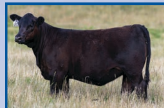
Blackcap Empress Ellston B56 6 month-old General Lee Daughter