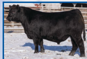
Hoover No Doubt B26 No Doubt Son Sells February 6, 2024