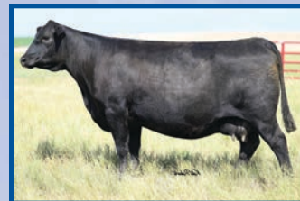
Deep Creek Rain Lass 013 Dam of Legitimate