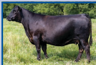
Erica of Ellston S7 38 Special Daughter Pathfinder Hoover Angus Donor