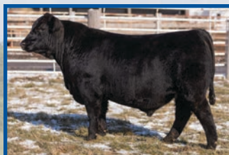
Hoover General Lee B5 General Lee Son Sells February 6, 2024