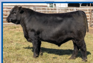
Hoover Chairman Z463 $12,000 Chairman Son

[AMF, CAF, D2F, DDF, M1F, NHF, OHF, OSF, RDF]