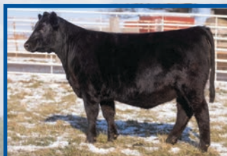
Erica of Ellston B44 Optics Daughter Sells February 6, 2024