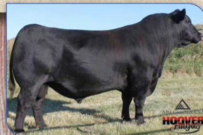
Hoover No Doubt

Countdown To 100...96 Years of Angus Genetics by the Hoover Family