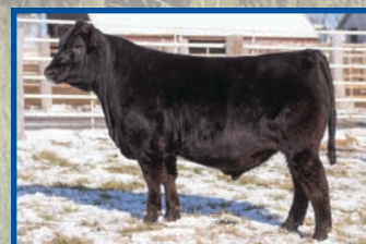
Hoover General Lee B163 General Lee Son Sells February 6, 2024

For more photos and detailed information on Hoover herd sires, visit www.hooverangus.com/herdsires.html