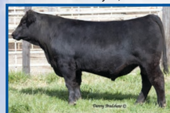
Hoover Mahomes $15,500 Entice Son

presence in a mid-6 frame. He is wide based, super long, big ribbed, square hipped, tight sheathed, and has abundant thickness. Entice exhibits superior foot shape, and we see this in his progeny too – we see Entice as a breed improver for foot shape. You can improve testicle size in one generation using Entice too!