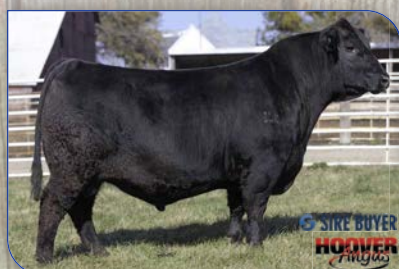
E L K Trophyclass