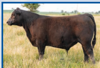
Hoover General Lee B12 6 month-old General Lee Son Sells February 6, 2024