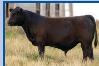
Hoover Optics B50 6 month-old Optics Son Sells February 6, 2024