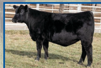
Blackcap Empress Ellston A85 $4500 Optics Daughter

vast majority of current Angus pedigrees.