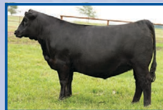
Erica of Ellston Z37 $36,500 No Doubt Daughter