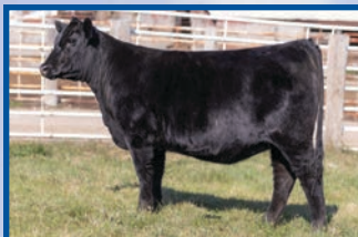
Prim Lassie of Ellston A476 Elite Daughter Sells February 6, 2024