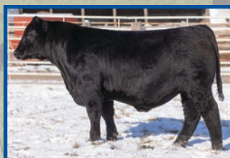
Hoover Optics B6 Optics Son Sells February 6, 2024