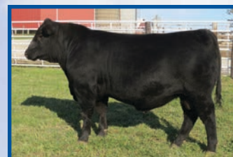
Hoover 38 Special S4 $39,000 38 Special Son