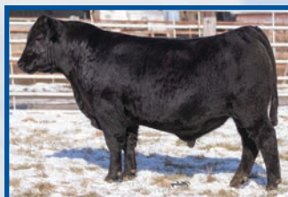
Hoover Optics B14 Optics Son Sells February 6, 2024