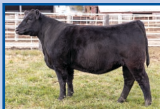
Erica of Ellston X85 $26,000 No Doubt Daughter