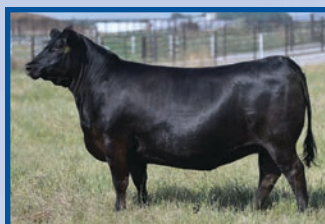
Erica of Ellston T220 $20,000 38 Special Daughter