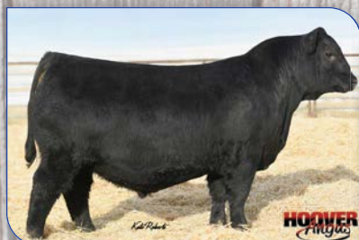
Deep Creek Legitimate 203

Countdown To 100...96 Years of Angus Genetics by the Hoover Family