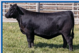
Blackcap Empress Ellston B1 8 month-old General Lee Daughter