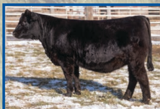
Miss Blackcap Ellston B64 General Lee Daughter Sells February 6, 2024