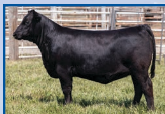
Miss Blackcap Ellston B49 8 month-old Trophyclass Daughter