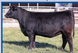
Erica of Ellston V88 $32,000 Entice Daughter