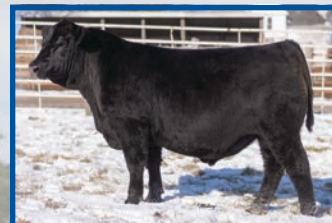
Hoover Trophyclass B98 Trophyclass Son Sells February 6, 2024