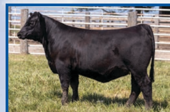
Erica of Ellston B17 8 month-old Optics Daughter