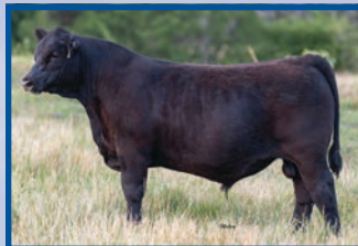
Hoover Optics B2 6 month-old Optics Son Sells February 6, 2024