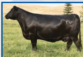
Pine Coulee Black Annie U7 Dam of Trophyclass Pictured at 8 years of age