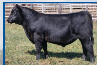
Hoover Optics A52 $8000 Optics Son