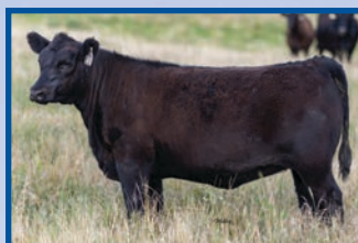
Blackcap Empress Ellston B32 6 month-old Optics Daughter