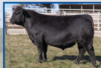
Hoover Athlete A477 Athlete Son Sells February 6, 2024