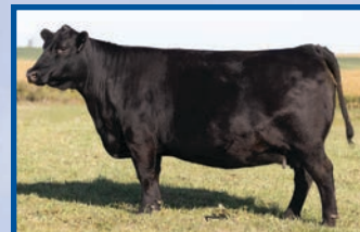
Erica of Ellston R217 Dam of Elite Pathfinder Hoover Donor