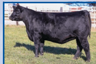
Gammer of Ellston V225 $7250 Chairman Daughter