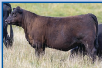
Blackcap Empress Ellston B9 6 month-old General Lee Daughter