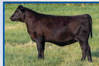
Blueblood Lady Ellston B54 6 month-old General Lee Daughter