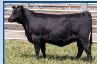
Blackcap Empress Ellston B15 8 month-old General Lee Daughter