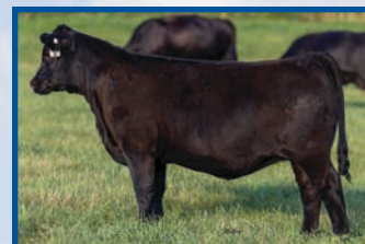
Blackcap Empress Ellston B8 6 month-old Optics Daughter