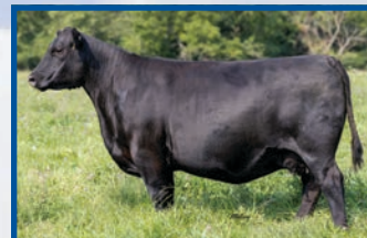
Erica of Ellston N54 Grandam of Elite Pathfinder Hoover Donor