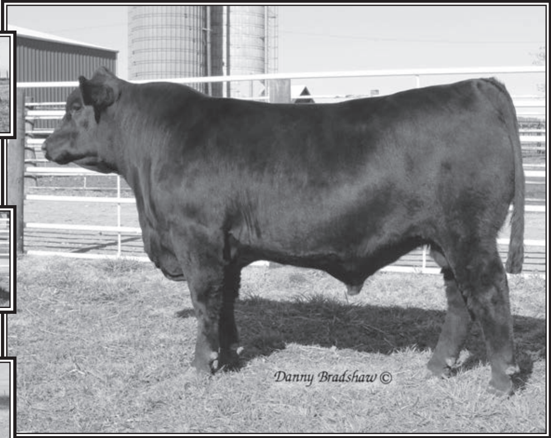
HOOVER BULLSEYE N469 – Lot 113