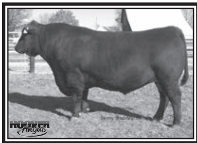
Connealy Reward Hoover Angus Herd Sire Maternal Grand sire of Lots 175-177

HOVER 178 EDELLA OF ELLSTON N443 Fall Bred Heifer Reg. 18135937 Tattoo: L/R N443 8/25/2014 SydGen C C & 7 # S A F Connection # HOVER EMPEROR SydGen Forever Lady 4087 Blkcp Empress Ellston G403 # TC Friction 5130 # MCATL Triple Stack 889-495 Blkcp Empress Ellston D515 # EDELLA OF ELLSTON K150 MCATL Triple Stack # Edella of Ellston F9 M A Barbara 495 # TC Gridiron 258 # Hawley Rain Girl 458 #