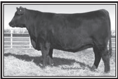
Lady Ida of Ellston H6 Owned by KDS Angus $33,500 Grandam of Lot 150 Full Sister to the Dam of Lot 151