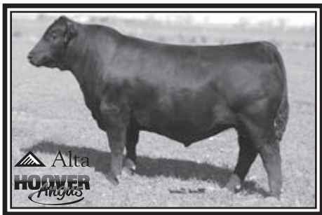
Hoover Inspiration Owned with Alta Genetics $56,000 Full Brother to the Dam of Lot 151 Full Brother to the Grandam of Lot 150