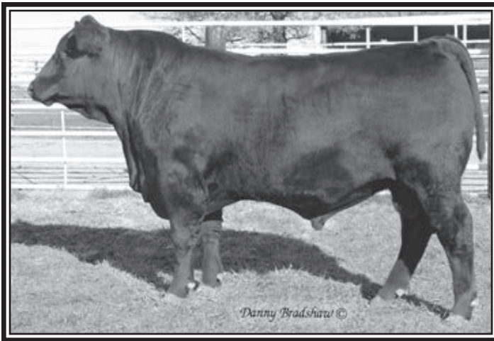
HOOVER BULLSEYE N487 – Lot 112