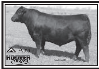
Hoover Inspiration Owned with Alta Genetics $56,000 Maternal Brother to Lots 48-50 Relative to Lots 46-52