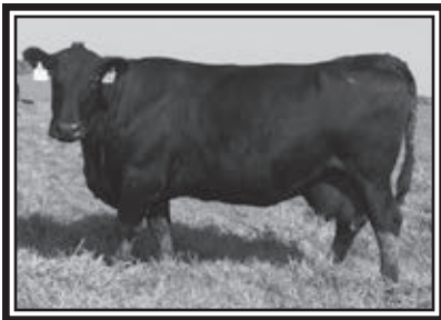
Keymura Katy V47 Pathfinder Fourth Generation Dam of Lot 112 Candid photo taken at 16 years of age, less than 24 hours before calving.