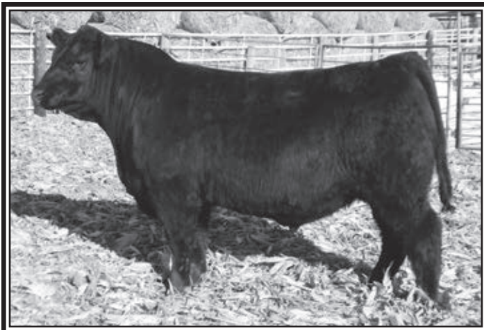
HOOVER IMPACT P158 – Lot 23