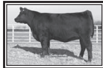
Lady Ida of Ellston J193 Owned by KDS Angus $20,000 Full Sister to the Dam of Lot 47 Relative to Lots 46-52