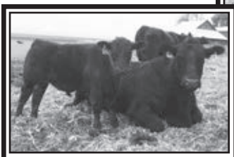
P32 as a calf with his dam.