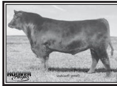
Roth Famous 1006 Hoover Angus Herd Sire Maternal Grand sire of Lots 161-162