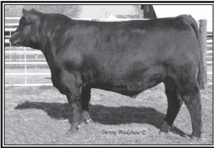
HOOVER EXCITEMENT N427 – Lot 105