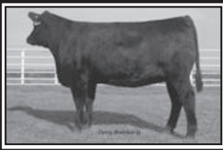
Miss Blackcap Ellston G417 Hoover Angus Donor Dam of Lot 98, Grandam of Lot 96 Maternal Sister to Lot 97