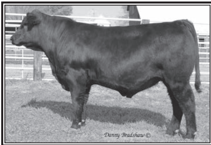
HOOVER BULLSEYE P25 – Lot 33