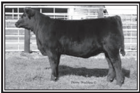
Erica of Ellston N62

$47,500 Maternal Brother to Lots 128-130 Relative to Lots 131-134