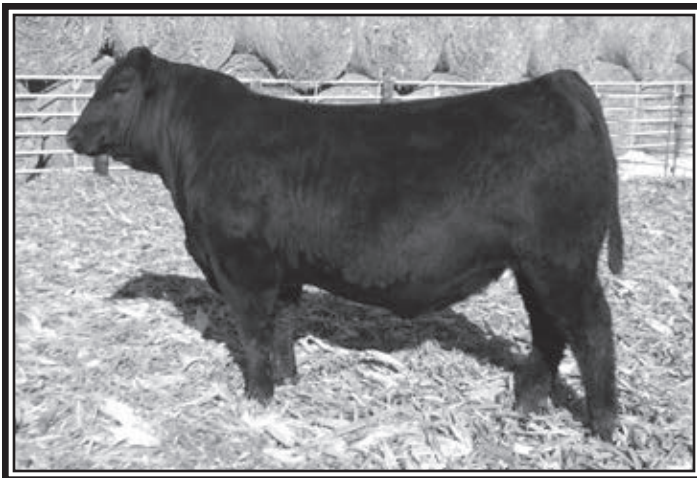
HOOVER IMPACT P194 – Lot 72