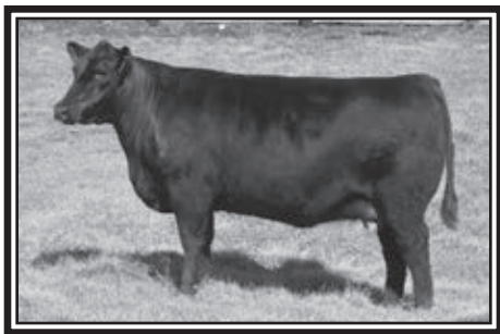
Queen of Ellston K11 Dam of Lot 78 Full Sister to Lot 79