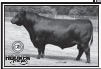
Hoover Emperor Owned with Genex $17,000 Maternal Brother to Lot 42