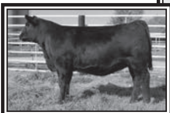
Erica of Ellston L5 Dam of Lot 2 Maternal Sister to the Dam of Lot 1 Relative to Lots 3-6