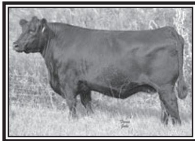
Elbamere Queen Ellston J229 Owned by Carter Angus $6250 Full Sister to the Dam of Lot 36