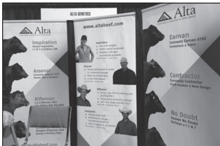
The Alta Genetics Booth at the 2015 American Angus Association Annual Meeting featured Hoover Inspiration (top left), Landi (top center), and Hoover No Doubt (bottom right).

★ N432 is recommended for larger framed heifers or cows.