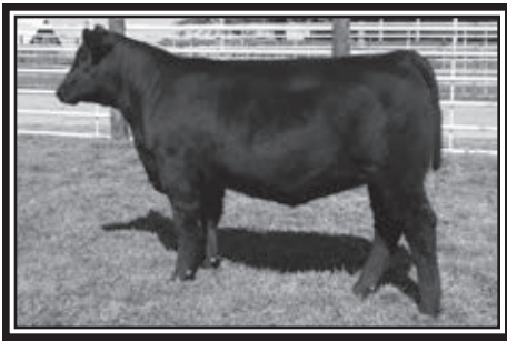
Blackcap Empress Ellston P11 Flush Sister to Lots 19-21 Relative to Lot 22