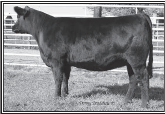
BLKCP EMPRESS ELLSTON N402 – Lot 167