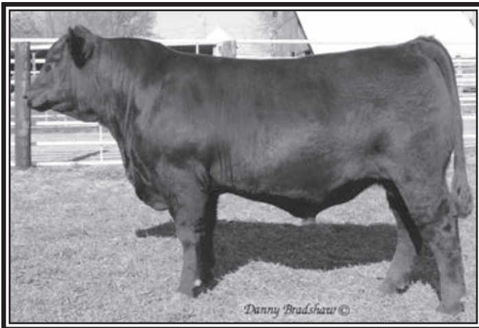
HOOVER EXCITEMENT P17 – Lot 17