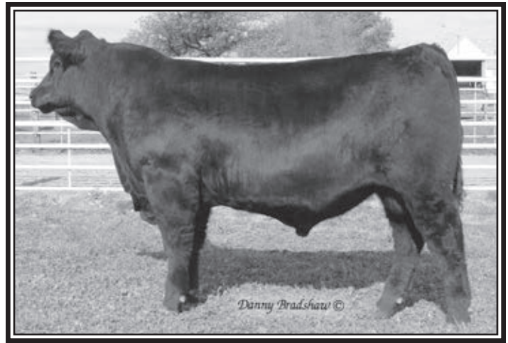
HOOVER TOP CUT P14 – Lot 20