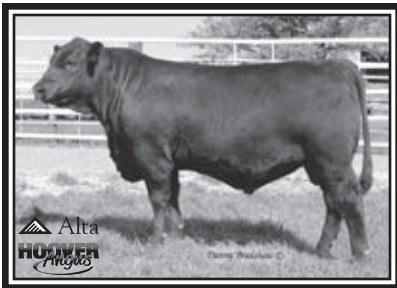
Hoover Explorer Owned with Alta Genetics and Diamond J Angus $19,500 Full Brother to Lot 16 Relative to Lots 15-18