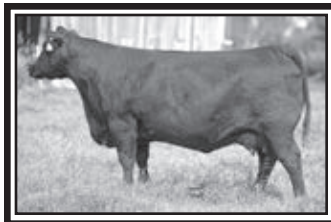
Lady Ida of Ellston G180 Owned by Carter Angus and Gary Wall $9000 Full Sister to the Dam of Lot 47 Relative to Lots 46-52