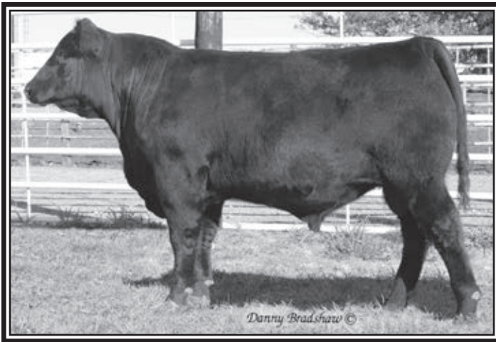
HOOVER TOP CUT P27 – Lot 21