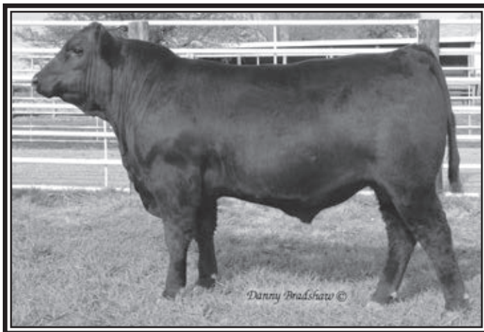
HOOVER DAM P75 – Lot 75