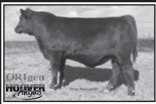
Hoover Hawkeye Owned with Three Trees Ranch $43,000 Grandson of Lot 113's Dam