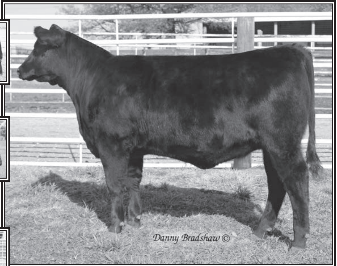
ERICA OF ELLSTON P36 – Lot 193