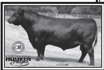
Hoover Emperor Owned with Genex $17,000 Maternal Brother to Lots 172-173