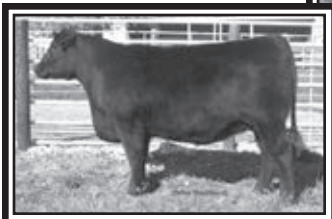
Erica of Ellston L160 Owned by Dean Houglan $14,250 Full Sister to the Dam of Lot 193