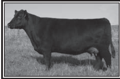
Blkcp Empress Ellston C344 Pathfinder Hoover Donor Pictured at 8 years of age Grandam of Lots 19-21 Relative to Lot 22