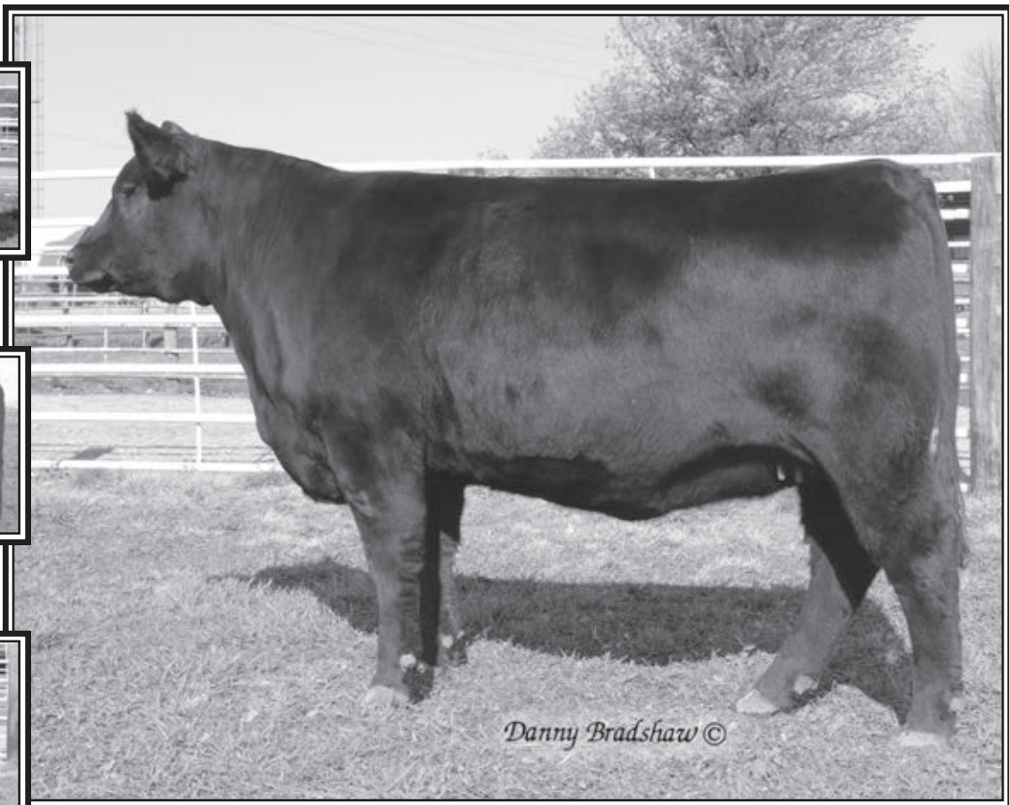
ERICA OF ELLSTON N3 – Lot 134