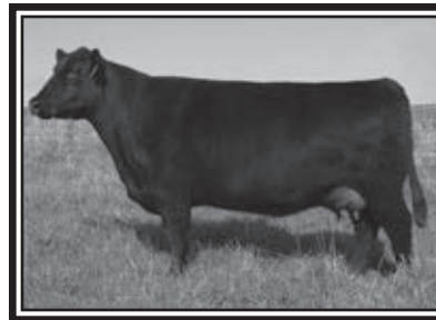
Blkcp Empress Ellston C344 Pathfinder Hoover Donor Pictured at 8 years of age Grandam of Lot 154