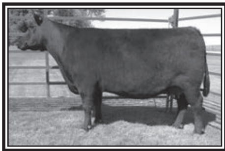
Lady Ida of Ellston C164 Pathfinder Hoover Donor Great Grandam of Lot 150 Grandam of Lot 151