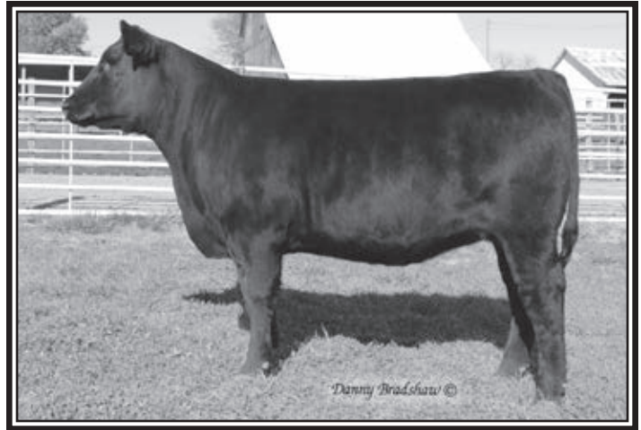
BLKCP EMPRESS ELLSTON N451 – Lot 172