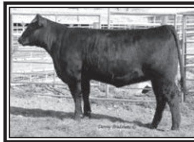
Blkcp Empress Ellston M454 Owned by Beck Angus Farm $9500 Maternal Sister to Lot 168