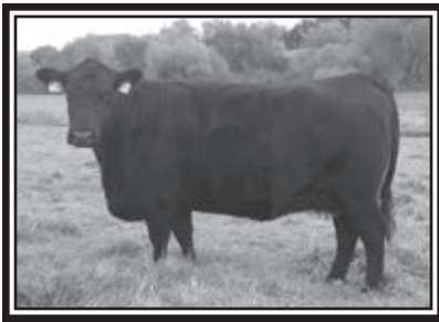
Candid photo of Queen of Ellston H115 Pathfinder Hoover Donor Dam of Lot 16 Maternal Sister to Lots 15 and 17