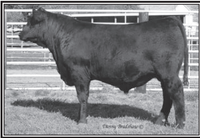
HOOVER IMPACT P26 – Lot 36