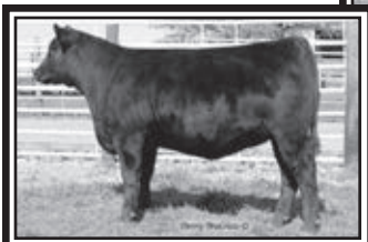
Erica of Ellston N31 Owned by KDS Angus $12,000 Flush Sister to Lot 134