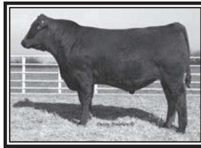
Hoover Excitement K109 Owned with McLean Ranches $10,500 Full Brother to Lot 17 Maternal Brother to Lot 15