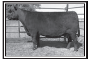
Lady Ida of Ellston C164 Pathfinder Hoover Donor Dam of Lots 48-50 Relative to Lots 46-52