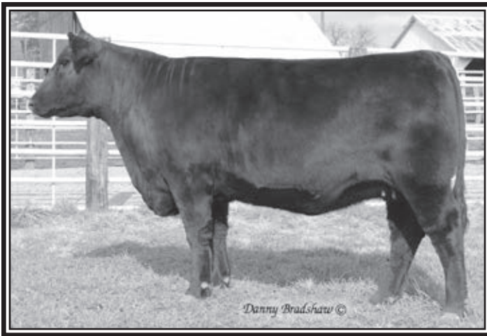
ERICA OF ELLSTON N150 – Lot 131