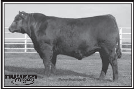
H&K Friction G290 Hoover Angus Herd Sire Full Brother to the Dam of Lots 19-21 Relative to Lot 22

HOOVER 20 Bull HOOVER TOP CUT P14 Reg. +18205558 Tattoo: L/R P14 1/6/2015