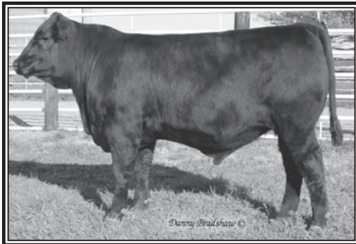
HOOVER HAWKEYE P202 – Lot 18