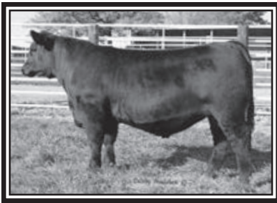
Hoover Bullseye N6 Owned by Larson Angus Cattle Co. $10,750 Full Brother to Lot 66 Maternal Brother to the Dam of Lot 67