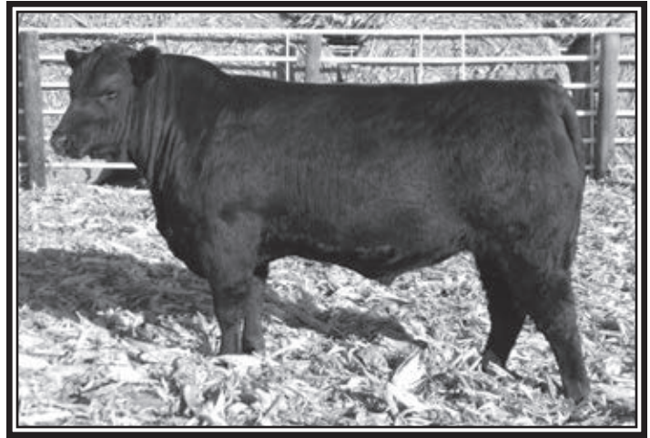
HOVER ELATION P79 – Lot 82