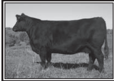
Queen of Ellston C50 Pathfinder Hoover Donor Dam of Lot 15 and 17 Grandam of Lot 16