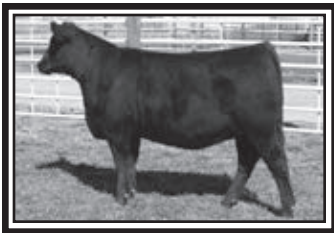
Lady Ida of Ellston P63 Flush Sister to Lots 48-49 Relative to Lots 46-52