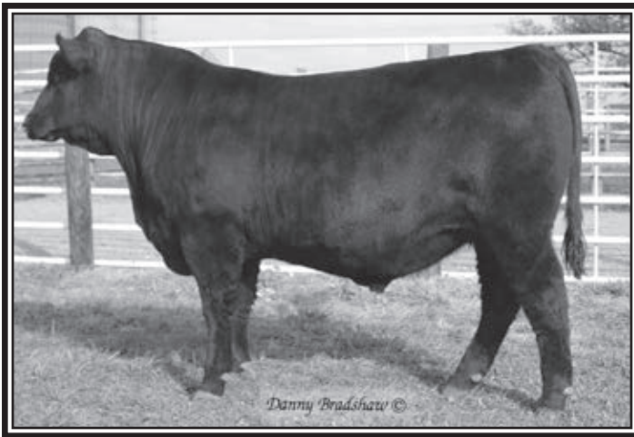
HOOVER COMMANDER P46 – Lot 46