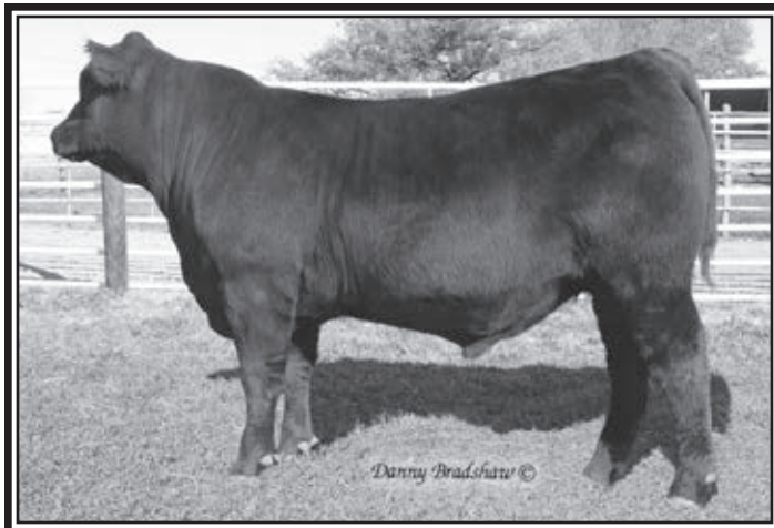
HOOVER BULLSEYE P24 – Lot 24