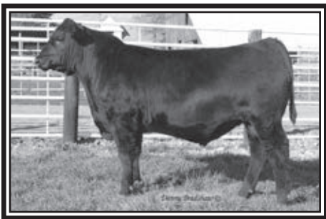
Hoover Dam N55 Owned by Gary Gorham $10,500 Full Brother to Lot 79 Full Brother to the Dam of Lot 78