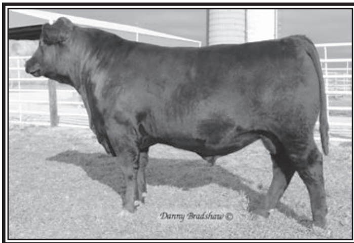
HOOVER INSPIRATION N409 – Lot 93

94 Bull HOOVER INSPIRATION N440 Reg. 18133864 Tattoo: L/R N440 8/24/2014