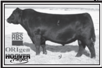
Hoover Dam $47,500 Full Brother to the Dam of Lot 193