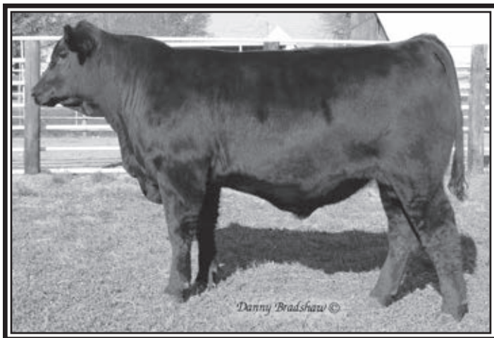
HOOVER BULLSEYE P192 – Lot 52

HOOVER 53 Bull HOOVER BULLSEYE P115 Reg. 18209648 Tattoo: L/R P115 2/11/2015 MOGCK Sure Shot MOGCK BULLSEYE Mogck Mary 1255 TC Gridiron 258 # EDELLA OF ELLSTON D270 Edella of Ellston A98 Mytty In Focus # Mogck Black Lass 2065 K C F Bennett Coalition SCC # Mogck Mary C 1757 G A R Grid Maker # TC Blackbird 7049 # S A Neutron 377 # Hawley Rain Girl 458 # BW +1.0 WW +63 5% Milk +28 15% YW +113 4% DOC +30 2%