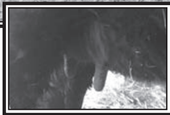
Udder of Erica of Ellston M38 Dam of Lot 1