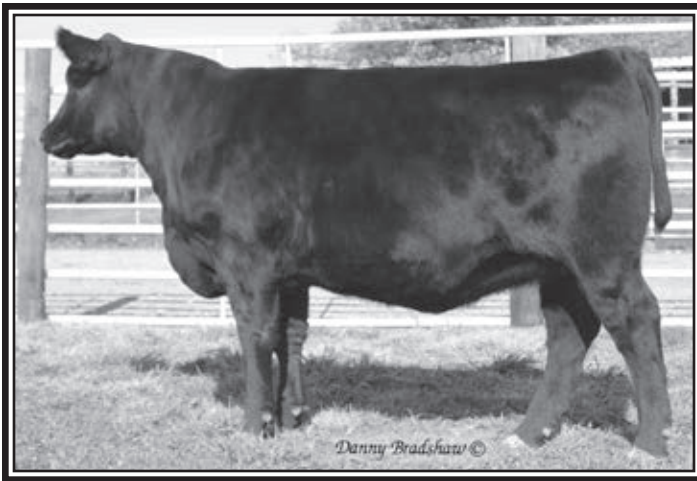
BLACKBIRD OF ELLSTON N249 – Lot 143

HOVER 144 Spring Bred Heifer BLACKBIRD OF ELLSTON N212 Reg. 17879408 Tattoo: L/R N212 2/22/2014 MOGCK Sure Shot MOGCK BULLSEYE Mogck Mary 1255 S A Neutron 377 # BLACKBIRD OF ELLSTON F278 Blackbird of Ellston S78 # Mytty In Focus # Mogck Black Lass 2065 K C F Bennett Coalition SCC # Mogck Mary C 1757 S A F Neutron # S A Queen Susan 102 # H&K Dark Star M163 # Blackbird of Ellston M78 #