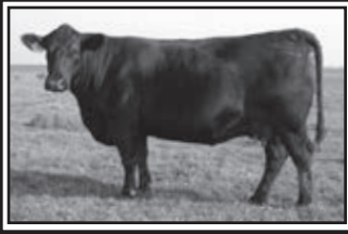
Miss Blackcap Ellston C446 Dam of Lot 97, Grandam of Lot 98 Great Grandam of Lot 96