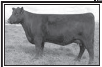
Erica of Ellston G366 Pathfinder Hoover Donor Dam of Lot 134