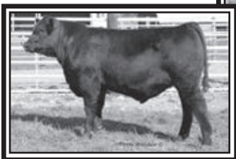
Hoover Counselor N270 Owned by Peterson Grain & Cattle and Top Notch Angus $13,250 Maternal Brother to the Dam of Lot 1 Full Brother to the Dam of Lot 2