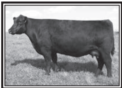
Princess of Ellston G25 Pathfinder Hoover Donor Dam of Lot 33

HOOVER 34 Bull HOOVER DAM P154 Reg. 18209662 Tattoo: L/R P154 2/16/2015 SydGen C C & 7 # S A F Connection # HOOVER DAM # SydGen Forever Lady 4087 Erica of Ellston C124 # TC Gridiron 258 # Erica of Ellston V65 Woodhill Fusion 177-70L Bon View New Design 878 # BLKCP EMPRESS ELLSTON D241 Woodhill Barbara 674-177 Blackcap Empress Ellston A28 S A Neutron 377 # Blackcap Empress J353