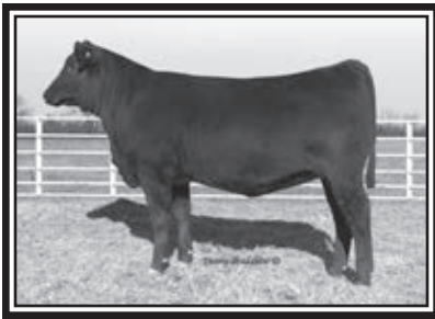
Blackcap Empress Ellston K19 Owned by KDS Angus $7500 Full Sister to Lot 8