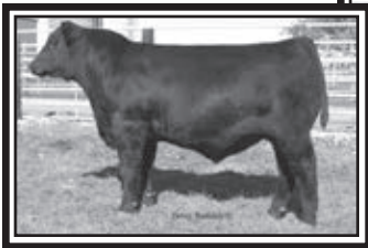
Hoover Herdmaker Full Brother to the Dam of Lot 1