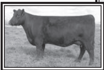
Erica of Ellston G366 Pathfinder Hoover Donor Grandam of Lots 1-2 Relative to Lots 3-6