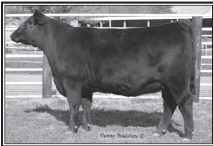
MISS ERICA ELLSTON N201 – Lot 162