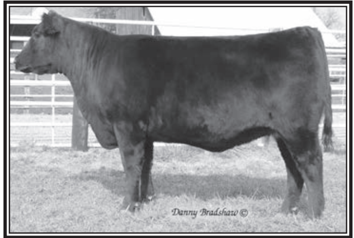
MISS BLACKCAP ELLSTON N48 - Lot 118