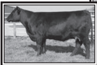
Blkcp Empress Ellston G403 Pathfinder Hoover Donor Dam of Lot 42