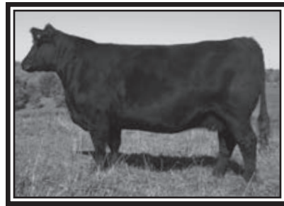
Queen of Ellston C50 Pathfinder Hoover Donor Grandam of Lot 92