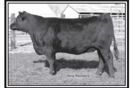
Queen of Ellston M27 Owned by West Angus Farm $8000 Full Sister to Lot 17 Maternal Sister to Lot 15