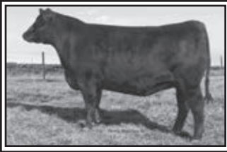
Miss Blackcap Ellston K98 Owned by KDS Angus $30,000 Maternal Sister to Lot 113