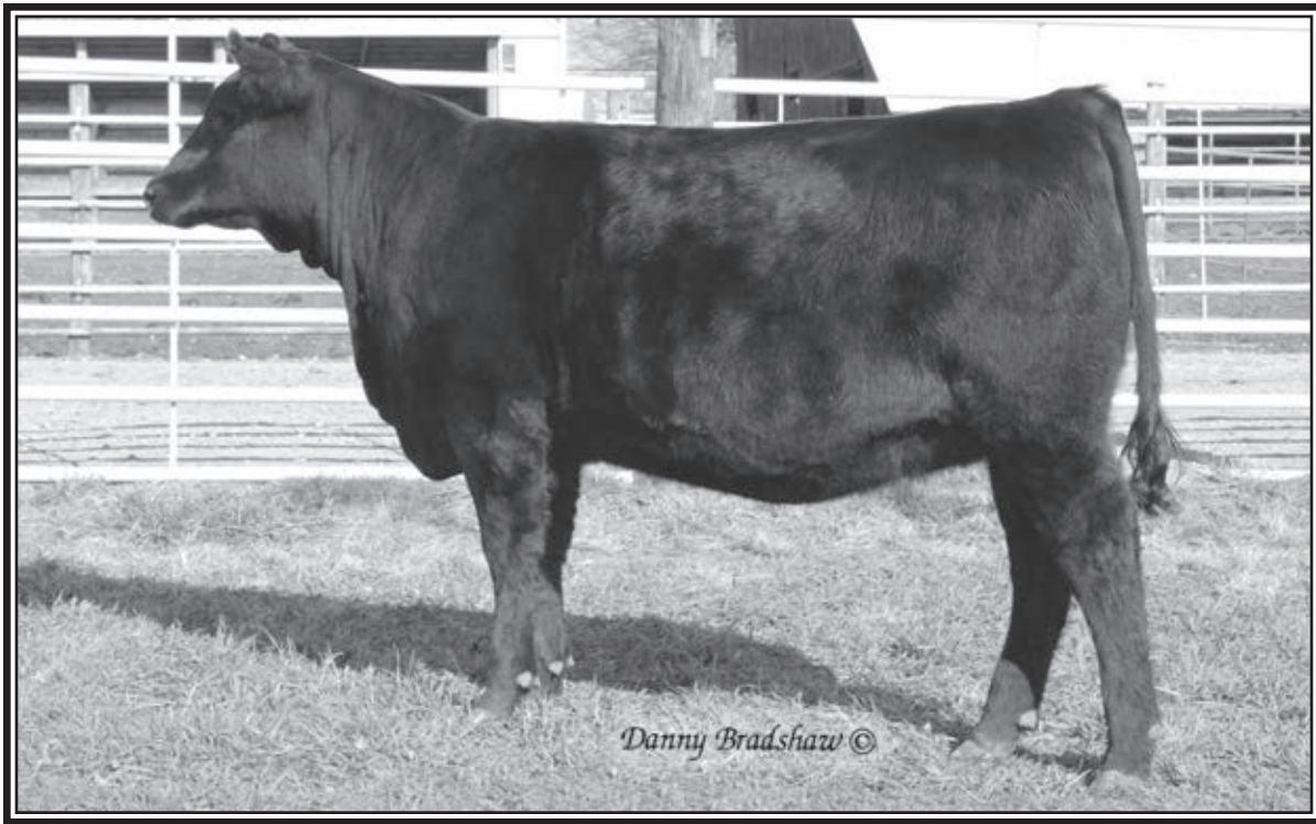
ERICA OF ELLSTON P168 – Lot 191