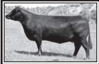
Hoover Dame Owned by the Hoover Dame Syndicate $50,000 Full Sister to the Dam of Lot 193