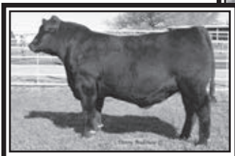
Hoover Direct Deposit N460 Flush Brother to Lots 172-173