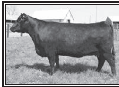
Blackcap Empress Ellston L4 Dam of Lot 22 Relative to Lots 19-21