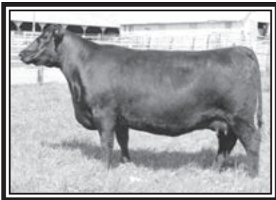
Erica of Ellston L16 Dam of Lot 131 Relative to Lots 128-134