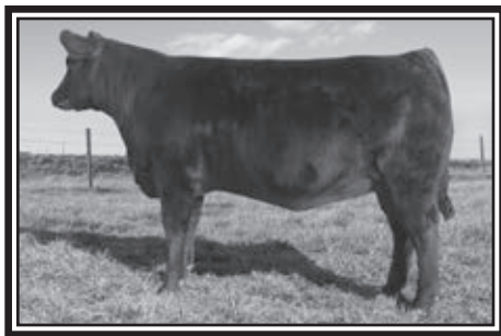
Queen of Ellston L22 Full Sister to the Dam of Lot 78 Full Sister to Lot 79