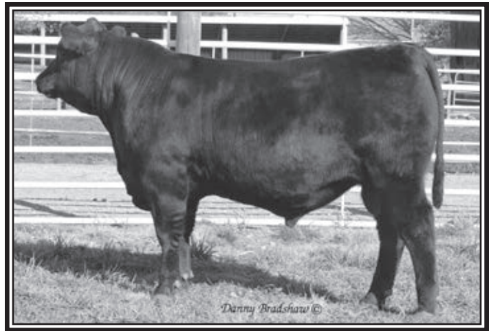
HOOVER HAWKEYE P125 – Lot 67