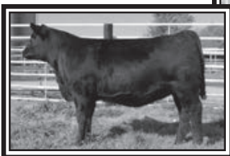
Erica of Ellston L5 Hoover Angus Donor Full Sister to Lot 134