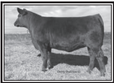
Black Beauty of Ellston M62 Owned by KDS Angus $15,000 Full Sister to Lot 122