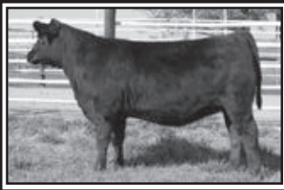
Miss Blackcap Ellston L23 Maternal Sister to Lot 113